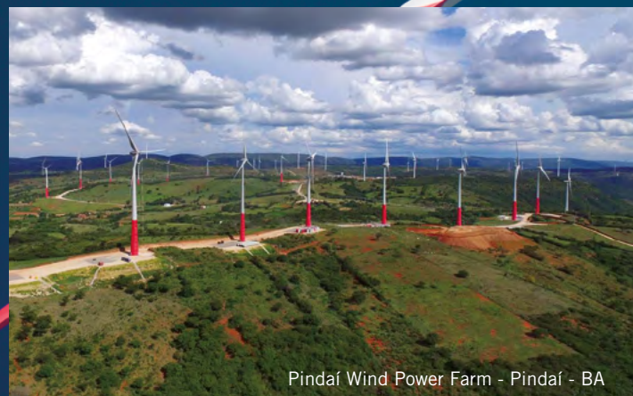
Pindaí Wind Power Farm - Pindaí - BA