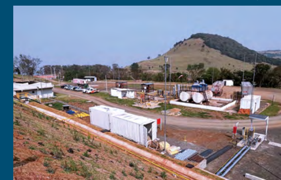
Barra Bonita Well - Pitanga - PR