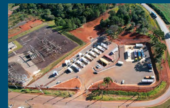
Barra Bonita TPP - Pitanga - PR

Production capacity 100.000 m 3 /day Total reserve – Barra Bonita 500 million m 3