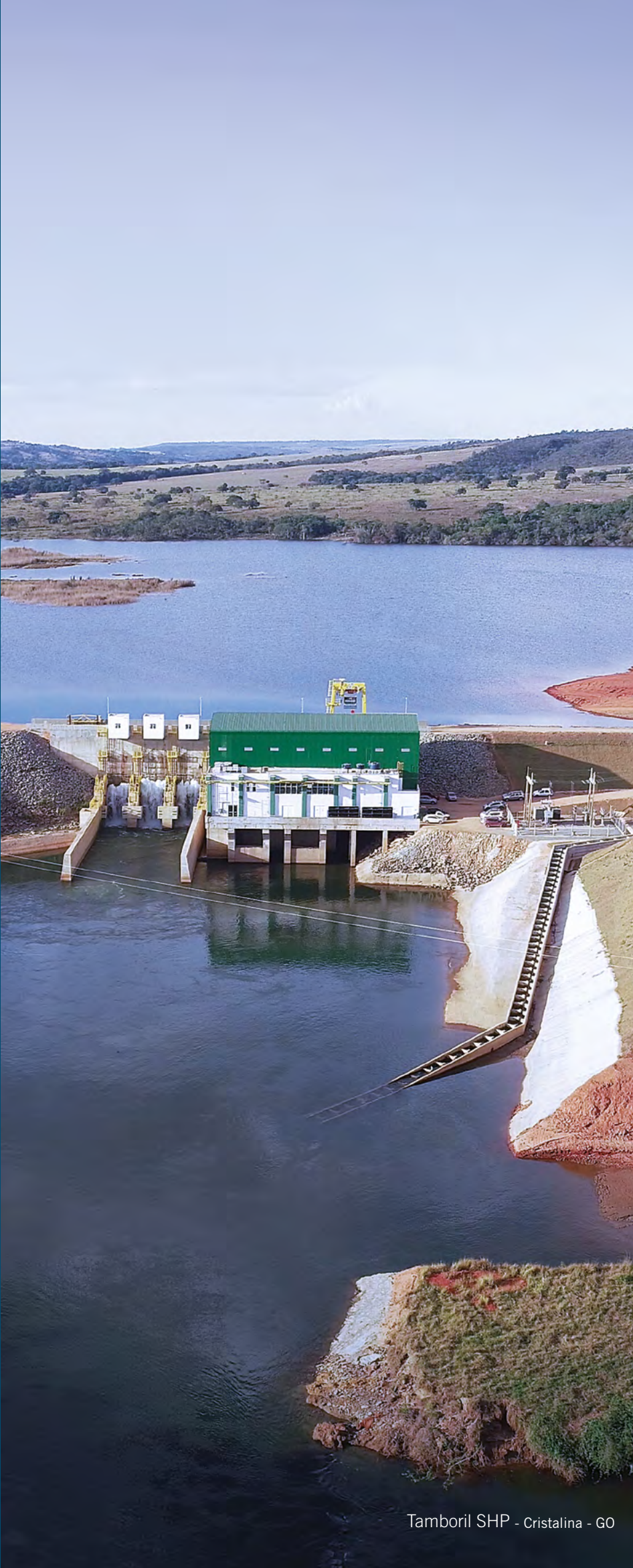
Tamboril SHP - Cristalina - GO