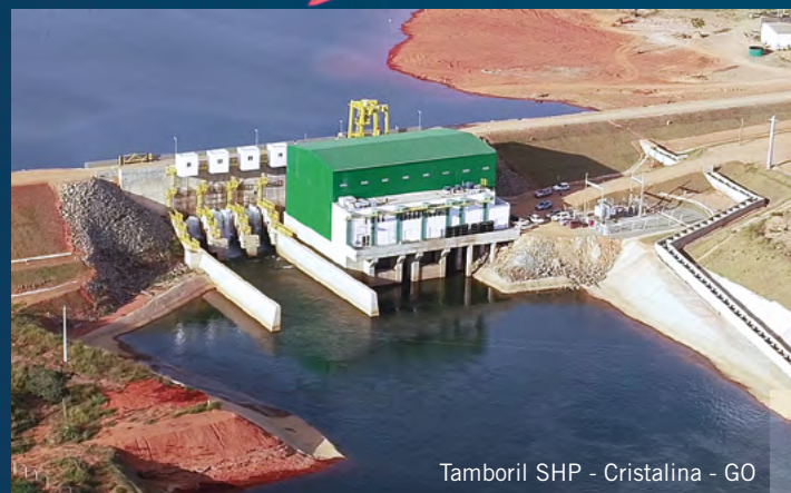
Tamboril SHP - Cristalina - GO

For energy generating businesses, we create paths to trade energy with stability and market intelligence. For consumers, we deliver efficiency and support to turn power into results. With nation-wide presence, we expand opportunities and build long-term relationships.