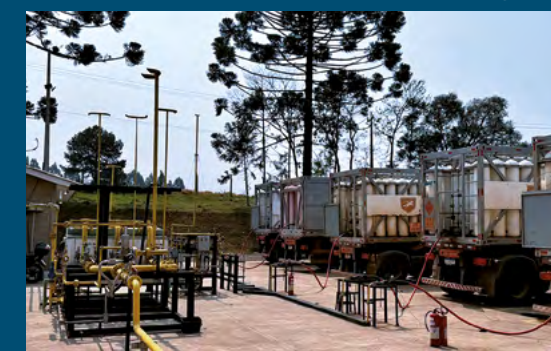
Barra Bonita Field - Pitanga - PR