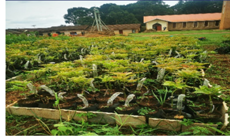
The nursery where members are planting a variety of timber and fruit trees.