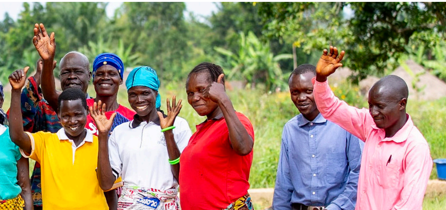
Savings Group members in Democratic Republic of the Congo