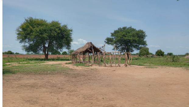
The village church being rebuilt