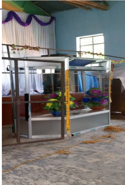
The pulpit purchased by the group for preachers in the local church.

When mature, these trees will create a sustainable source of income and offer financial, nutritional, and environmental benefits for the church and the community as a whole. It will be a while before their first harvest, but the church members are excited because they have faith and hope for their community's future, and they believe their combined efforts will be the seed of lasting change.