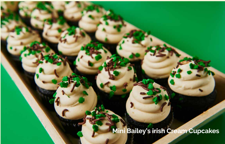
Mini Bailey's Irish Cream Cupcakes