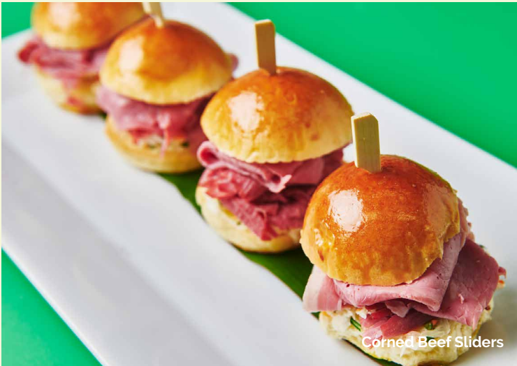
Corned Beef Sliders