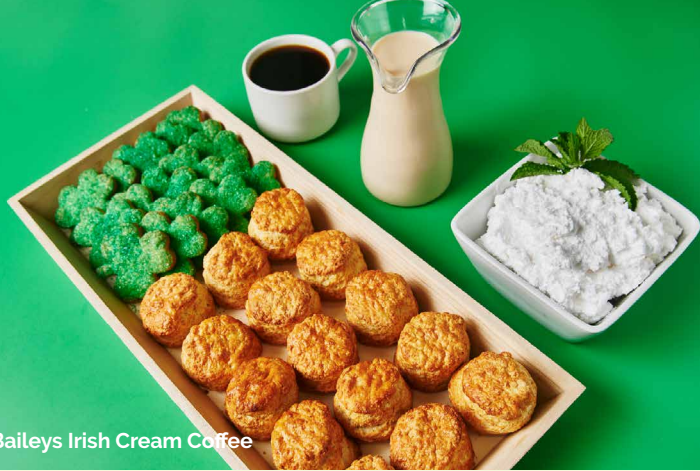
Baileys Irish Cream Coffee