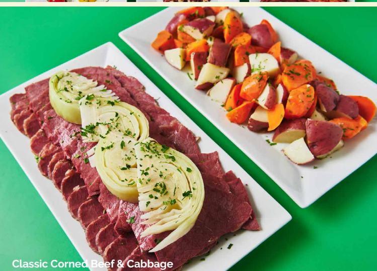
Classic Corned Beef & Cabbage