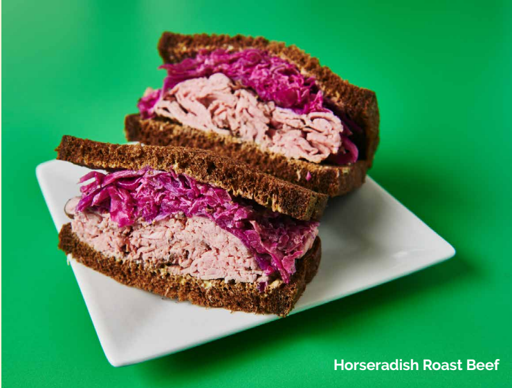
Horseradish Roast Beef

Vegetarian VG Gluten-Free GF Vegan V Nuts N