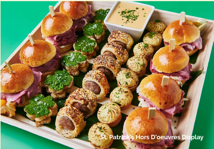
St. Patrick's Hors D'oeuvres Display