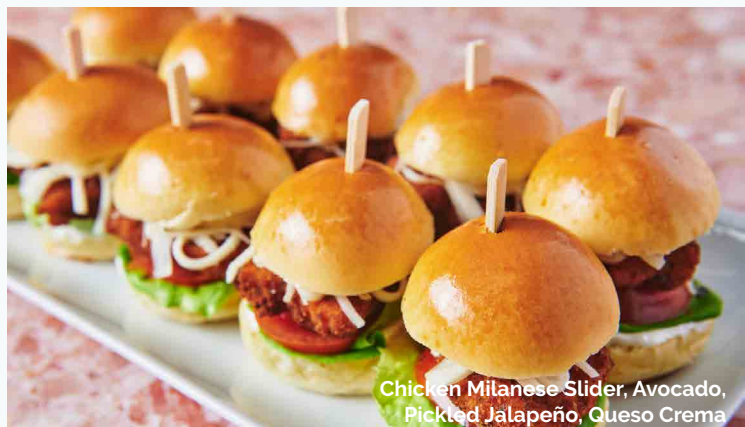
Chicken Milanese Slider, Avocado, Pickled Jalapeño, Queso Crema