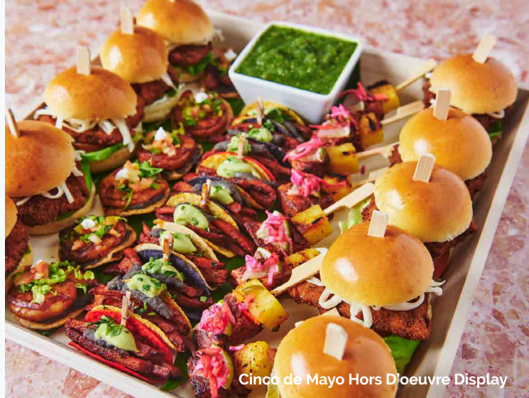
Cinco de Mayo Hors D'oeuvre Display

Skewered Pork Al Pastor, Grilled Pineapple GF 40.00