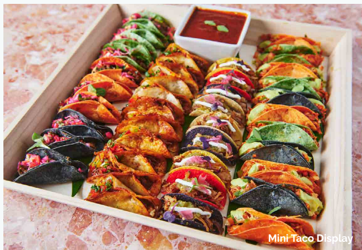
Mini Taco Display