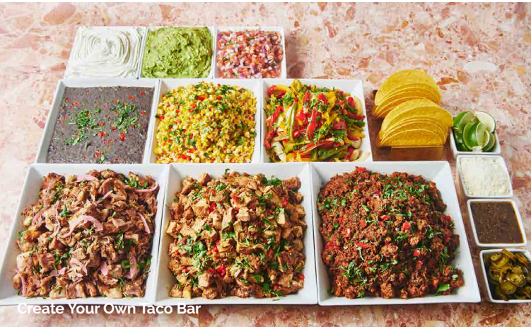
Create Your Own Taco Bar