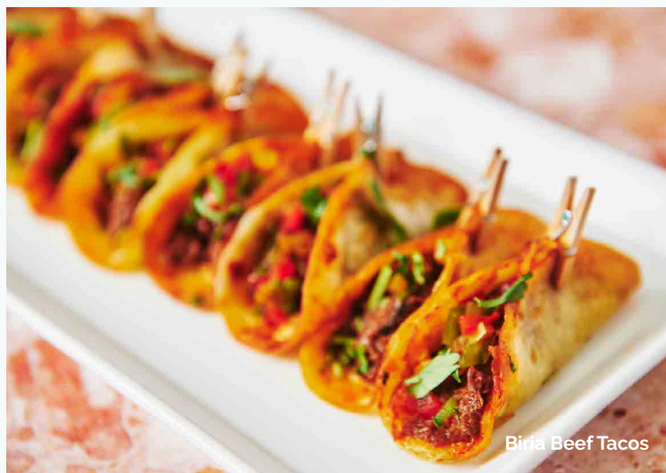
Birria Beef Tacos