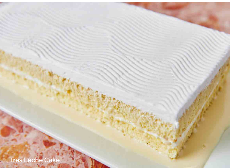
Tres Leche Cake