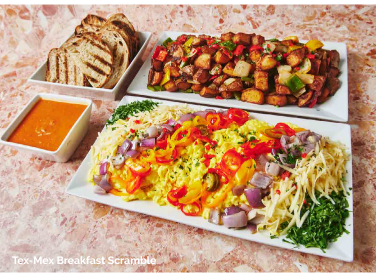
Tex-Mex Breakfast Scramble