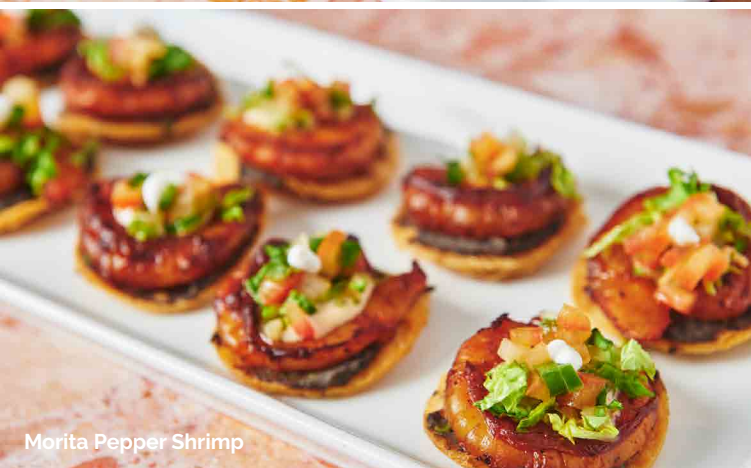
Morita Pepper Shrimp