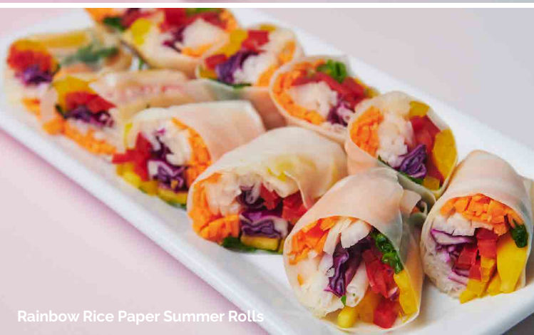
Rainbow Rice Paper Summer Rolls