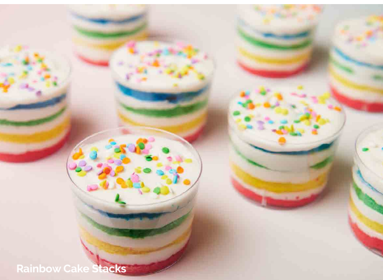
Rainbow Cake Stacks