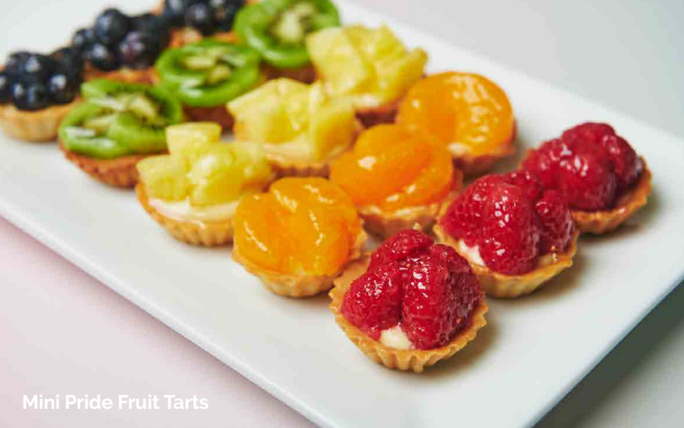
Mini Pride Fruit Tarts