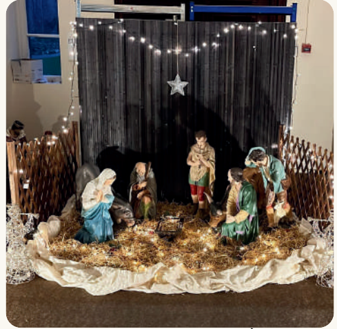
Our downstairs crib.