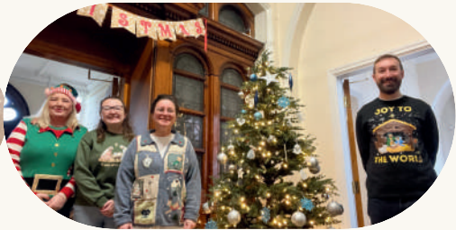
Us, wishing you a Merry Christmas.