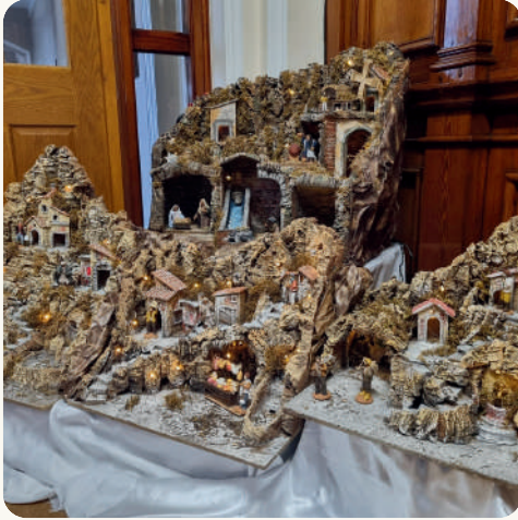
Fr Simon's Italian style crib. Chapel Crib.