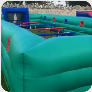
INFLATABLE HUMAN FOOTBALL