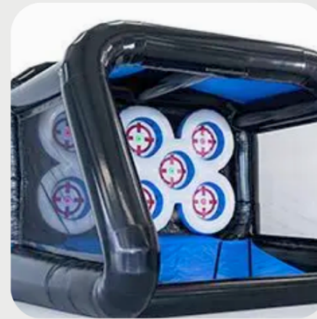
IPS ARCHERY SHOOTING