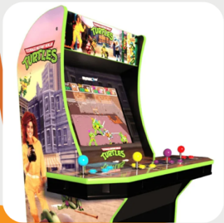
NINJA TURTLES ARCADE