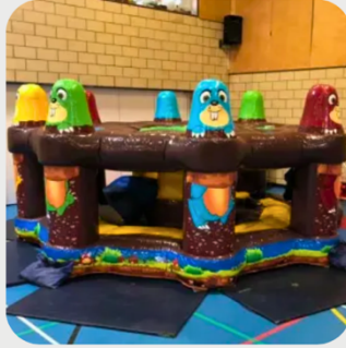
HUMAN 9 PEOPLE WHACK A MOLE