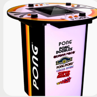
4 PONG ARCADE