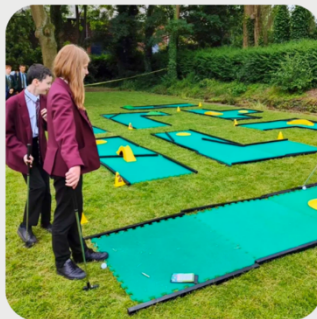
9 HOLE GOLF