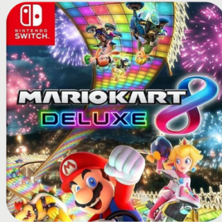
MARIO KART NINTENDOSWITCH