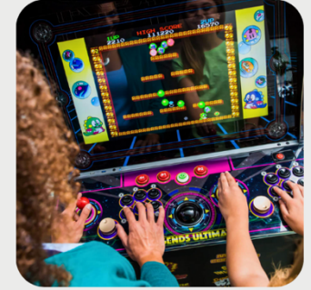
LEGENDS ULTIMATE ARCADE