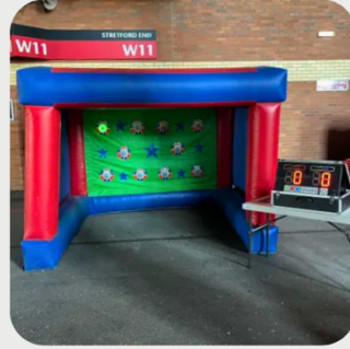
IPS WALL LIGHT