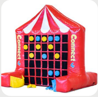
INFLATABLE CONNECT NAUGHTS AND CROSSES