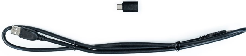
Figure 2. Tobii Pro Spark cable and adapter

If your computer has a USB Type-C interface, you can use the included USB Type-C male to Type-A female adapter.