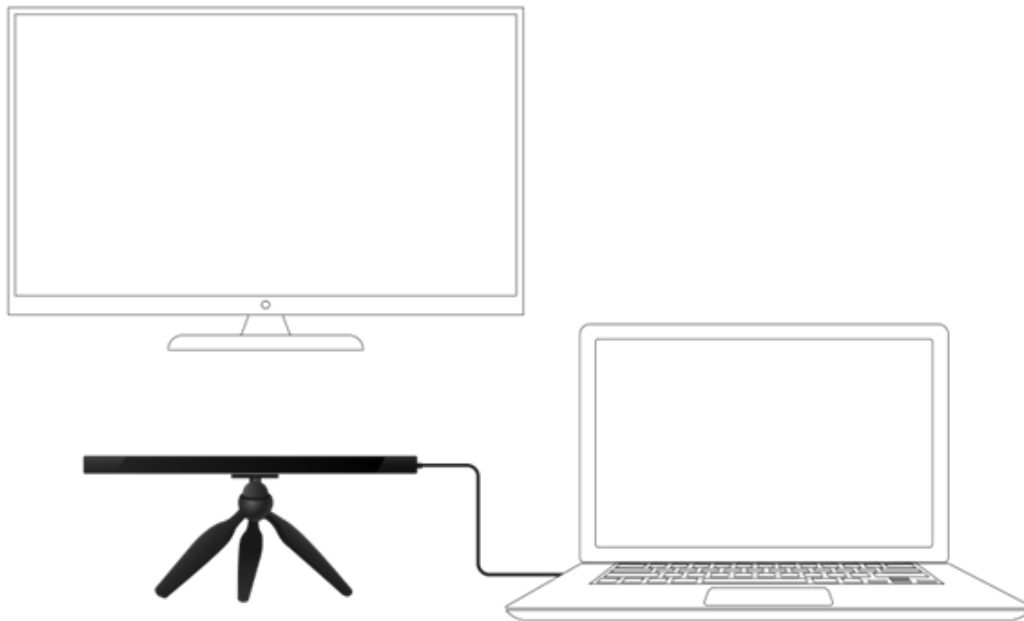
Figure 5. Tobii Pro Spark with the Tripod Stand and external, large-size monitor