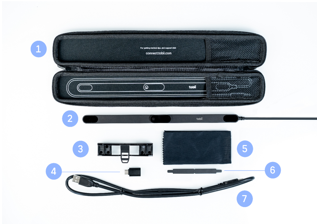
Figure 1. Tobii Pro Spark box and included items