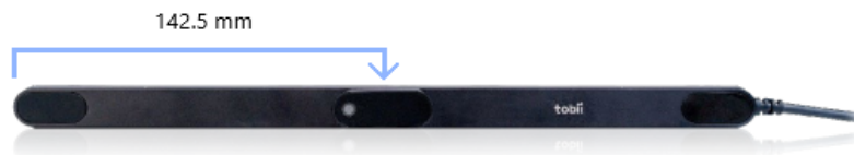
Figure 4. Tobii Pro Spark origin of UCS

User Coordinate System (UCS): a coordinate system used to communicate 3D positions for gaze calculations. The origin of the UCS is located at the top (center) of the eye tracker. This is also the external reference point for physical measurements in advanced setups.