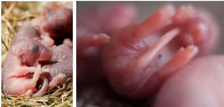
(Live animals pictured)