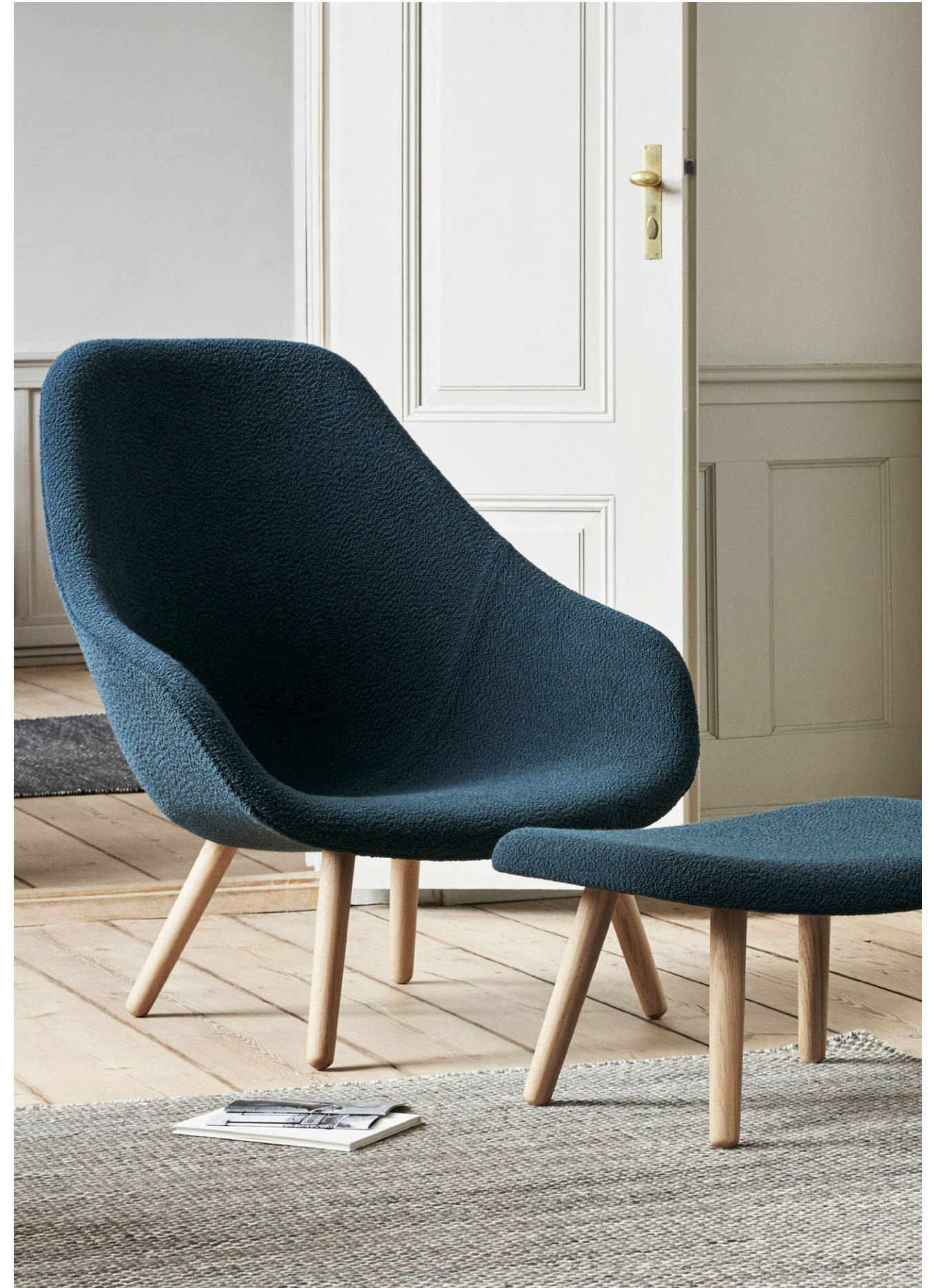
AAL 92 | Flamiber petrol blue | Water-based lacquered oak base

The About A Lounge Chair has a compact body with shaped armrests combined with round wooden legs. In line with the rest of the series, the sculpted design has been kept simple, with nothing left to chance. It is available in a low-backed version with a more intimate expression or a high-backed version with an open, spacious composition. The high-backed About A Lounge Chair is designed to create a cohesive look with the matching About an Ottoman, but it also functions perfectly on its own. The wide choice of cushions, legs and upholsteries mean you can configure unique combinations that fit a variety of public and private contexts. Optional seat cushion mounted with velcro.