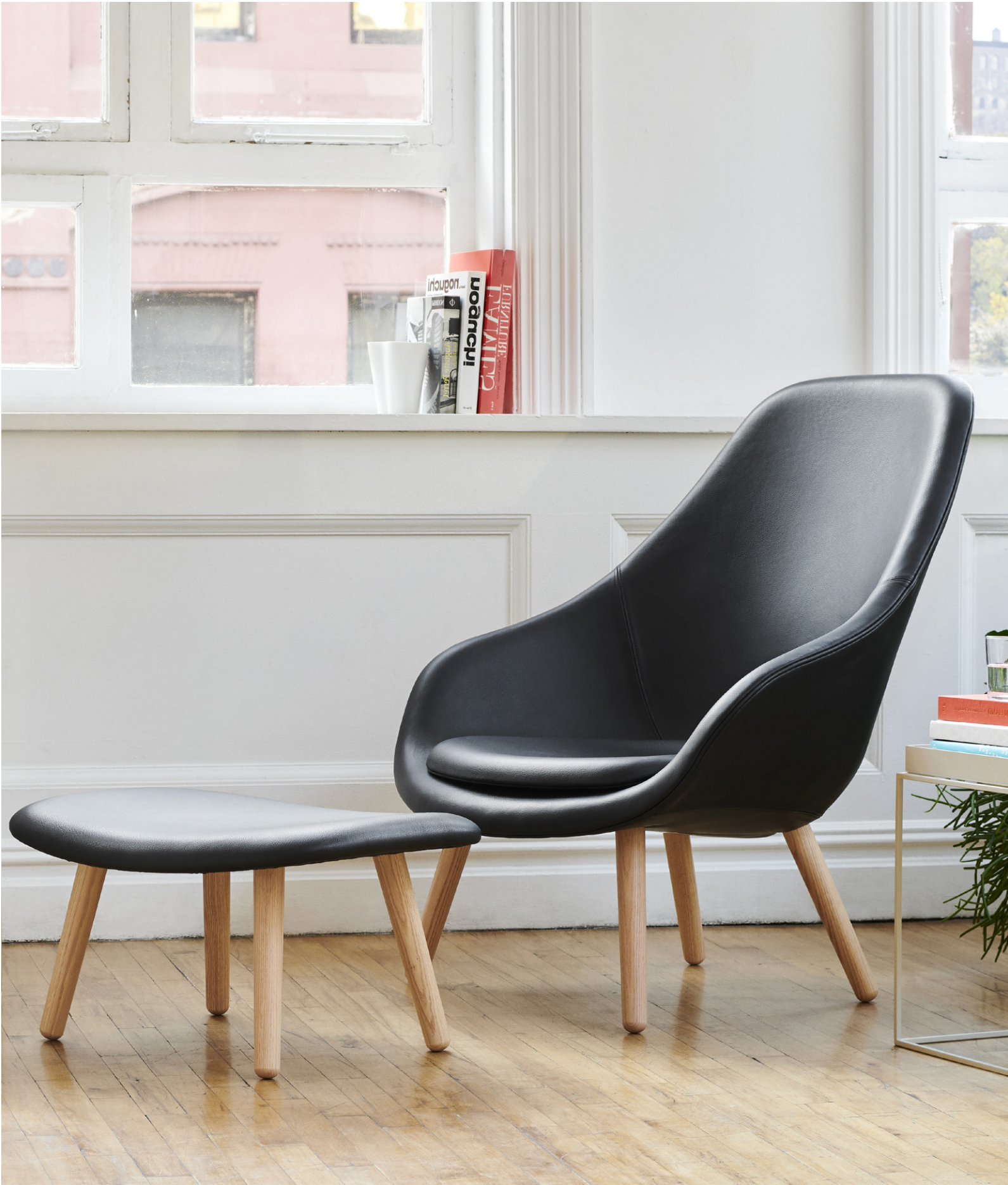
AAL 92 | California CA5001 black | Water-based lacquered oak base