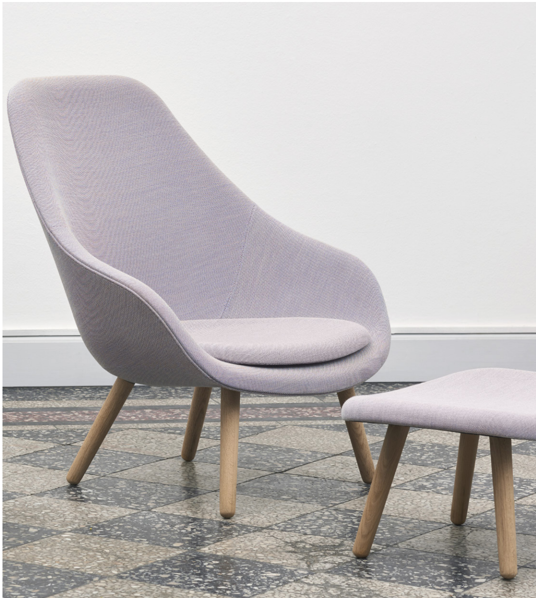
AAL 92 | Steelcut Trio 806 | Water-based lacquered oak base