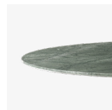
→ Verde Guatemala Marble