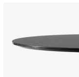
→ Nero Marquina Marble