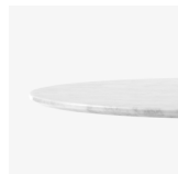
→ Bianco Carrara Marble