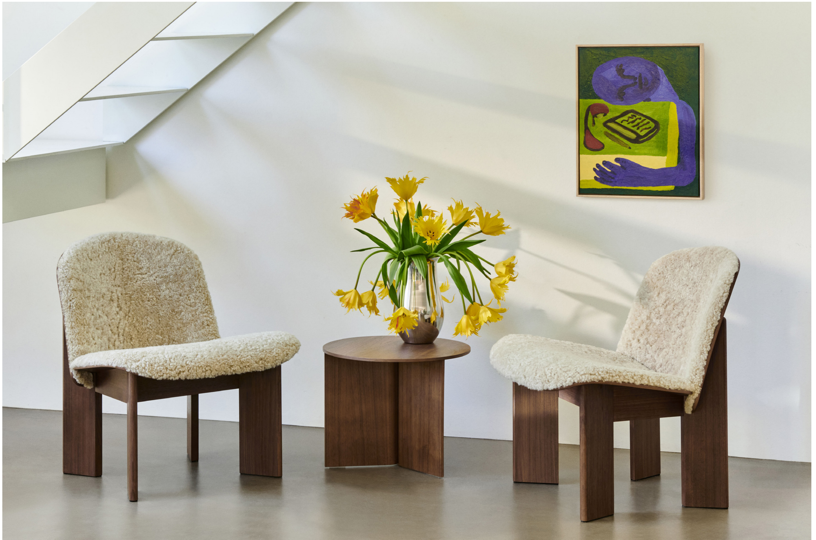
Chisel Lounge Chair | Sheepskin Mohawi 21 | Water-based lacquered walnut