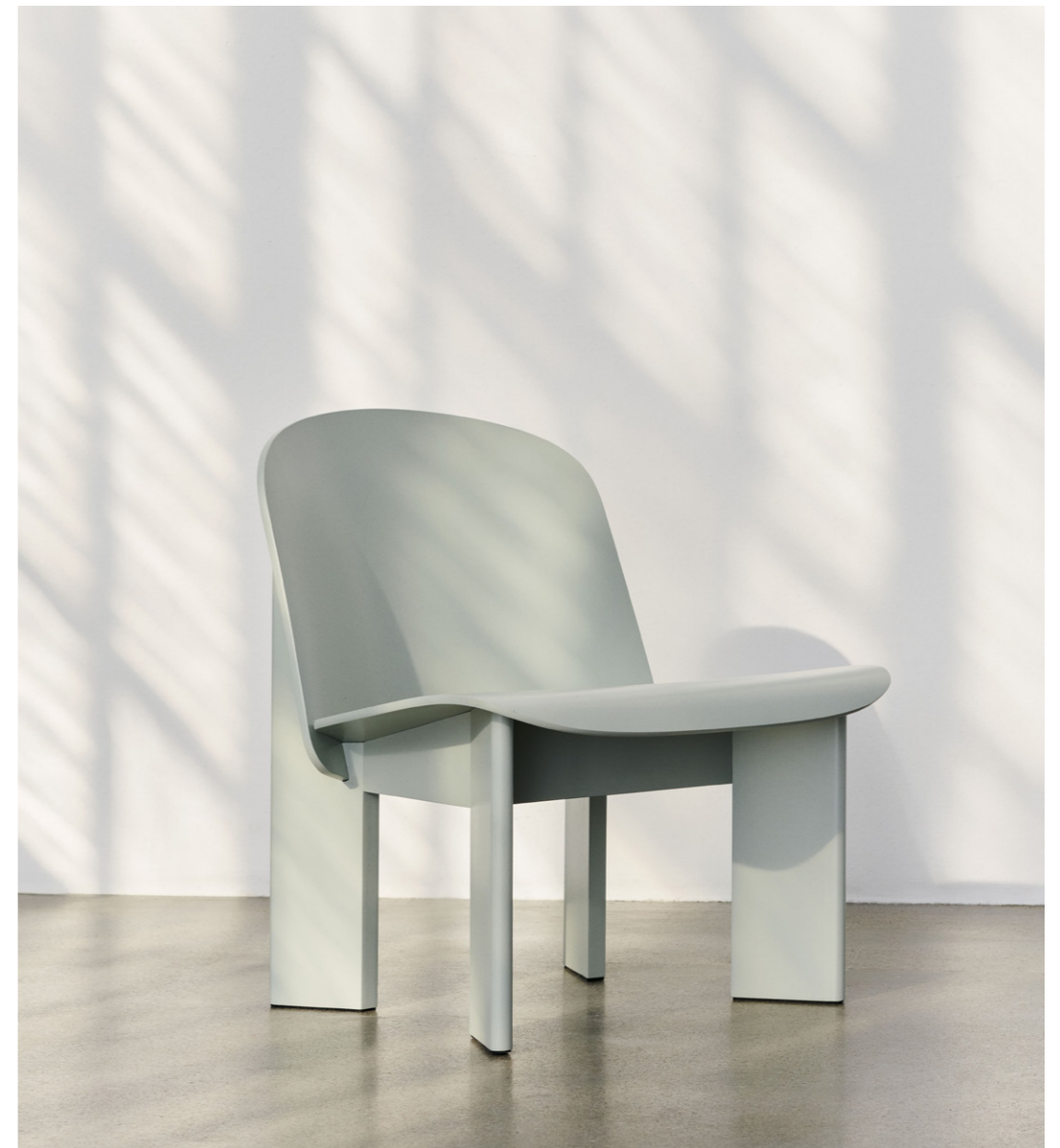
Chisel Lounge Chair | Eucalyptus water-based lacquered beech