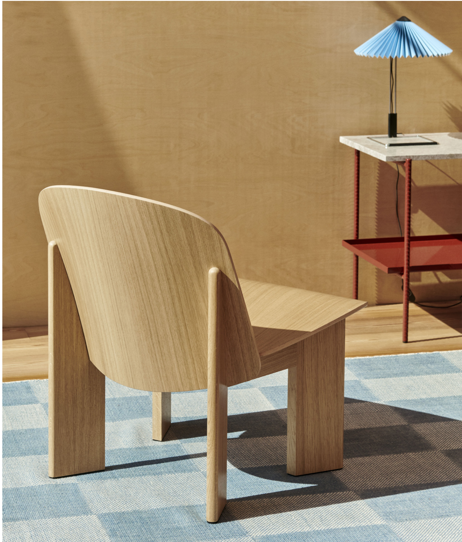
Chisel Lounge Chair | Water-based lacquered oak