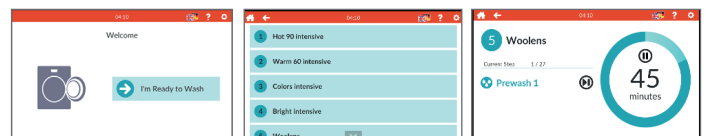
Approach, program and running cycle screen