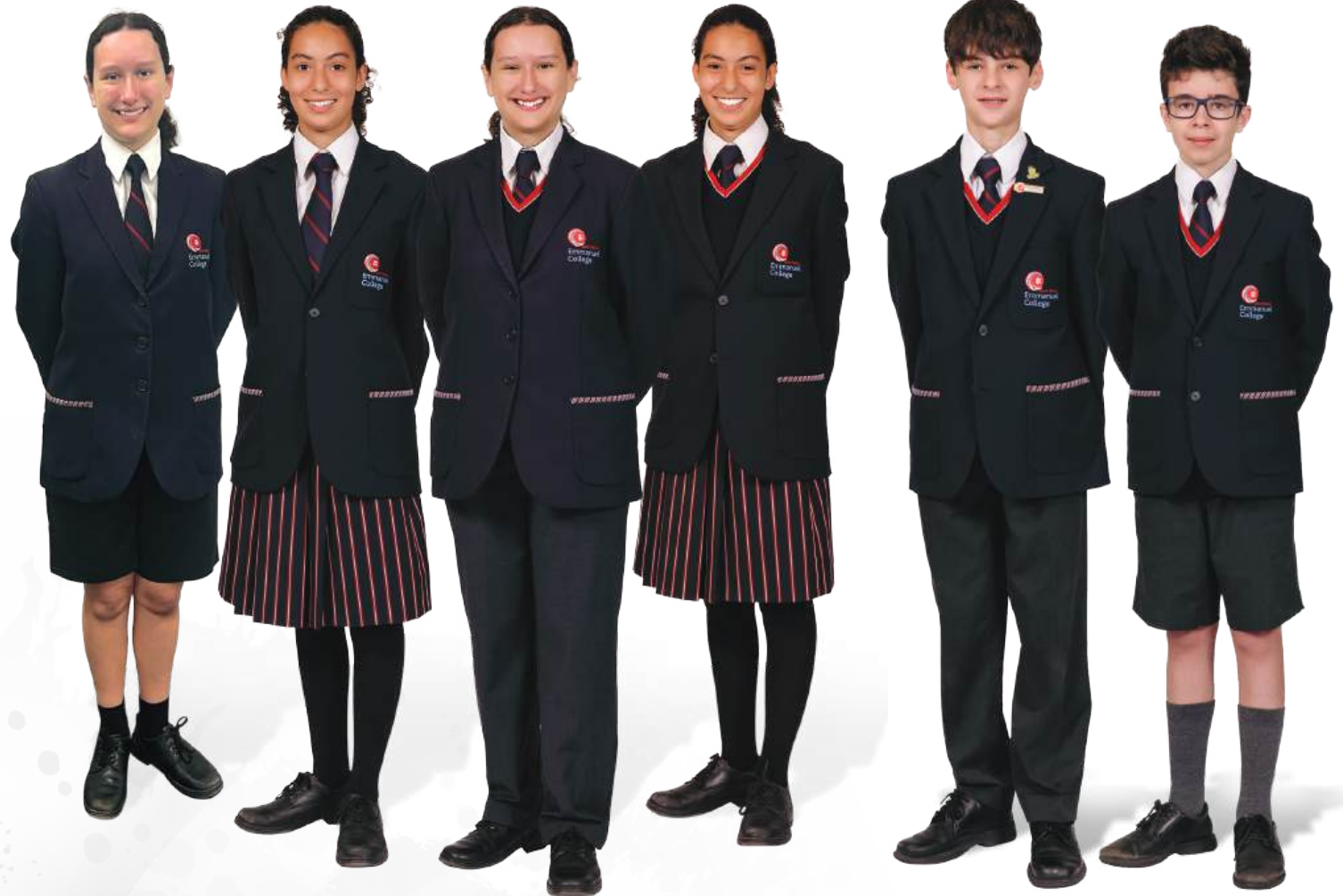
GIRLS - TERMS 2 & 3

Note: Skirt length to be no shorter than the top of the knee. Refer to uniform photos.