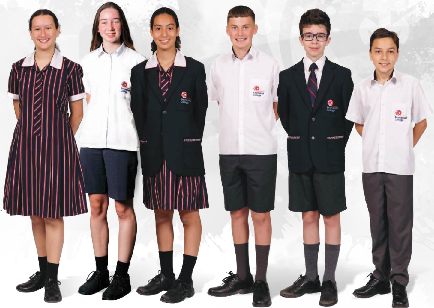
GIRLS - TERMS 1 & 4

Hats are encouraged to be worn outside at all times.