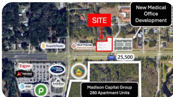
N St Augustine, FL

When you invest with Kingdom Resource Fund, you're joining a proven model that's already serving churches and communities with excellence. We're proud to be actively developing two current projects in: 📍 North St. Augustine, FL & 📍 East St. Cloud, FL