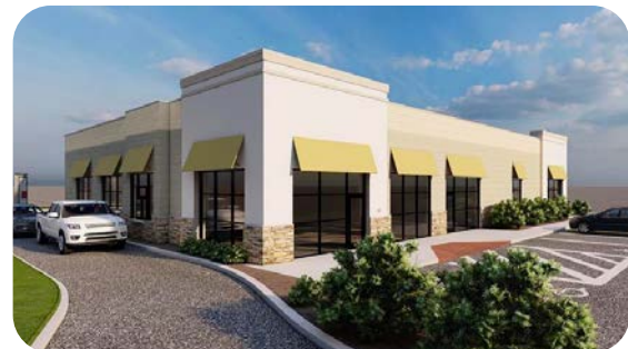
E St. Cloud, FL