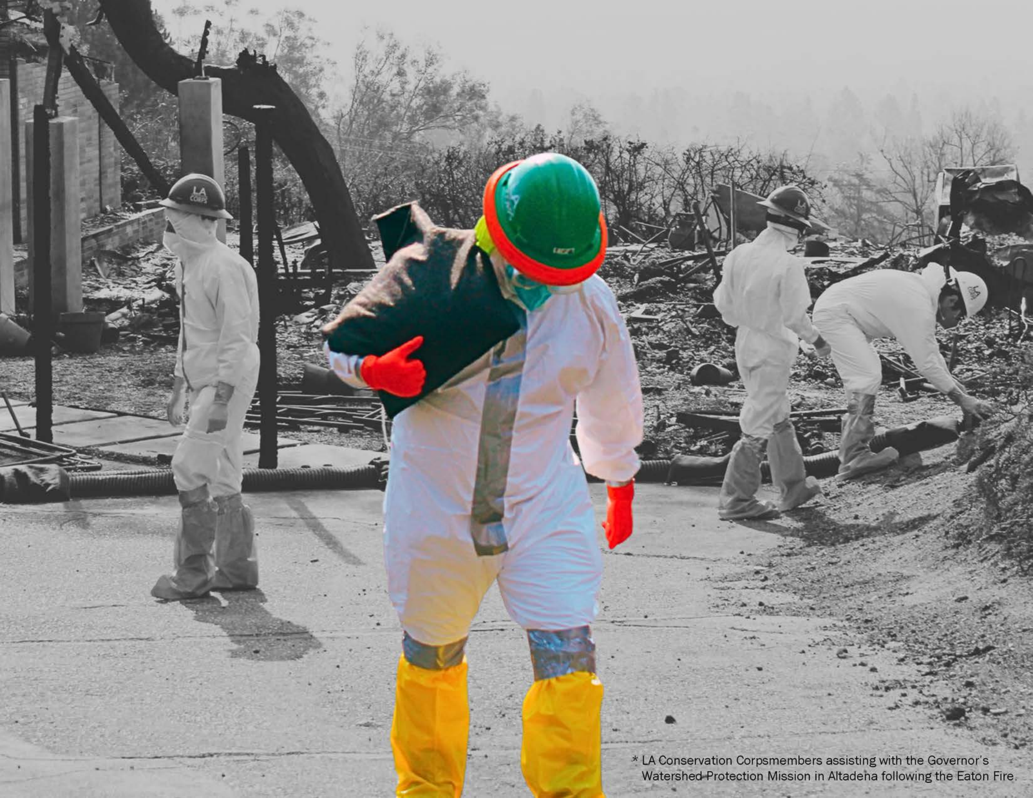
* LA Conservation Corpsmembers assisting with the Governor's Watershed Protection Mission in Altadena following the Eaton Fire.