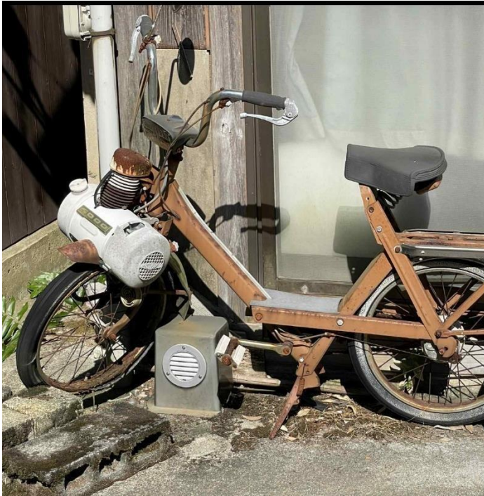
Outside Osaka Japan