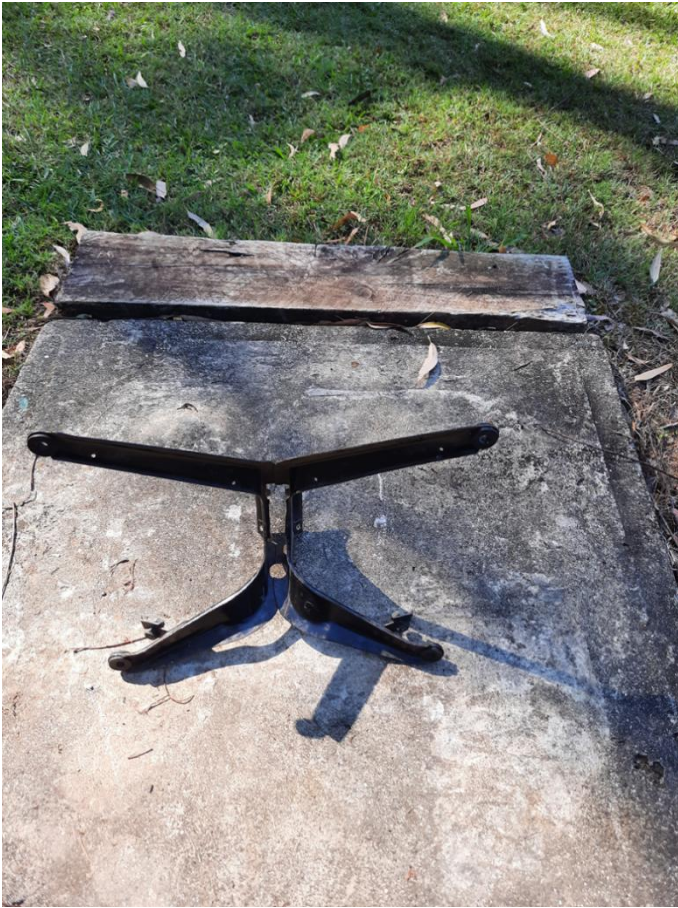
K100 Spider $60

Email any advertisements to editor.coffs.motorcycle.restorers@gmail.com