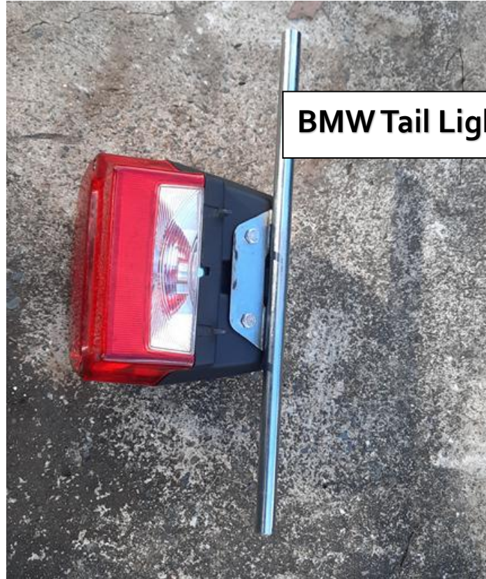
BMW Tail Light $100