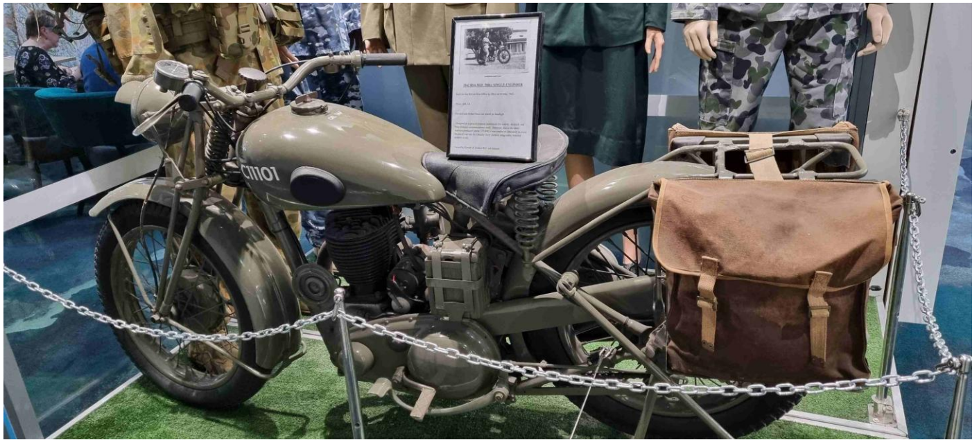
Featured at the Karuah RSL