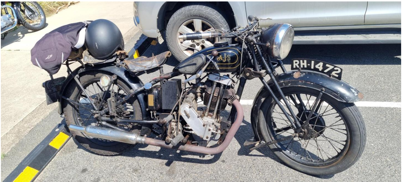
Mark Herfoss's AJS , North Beach Coffee