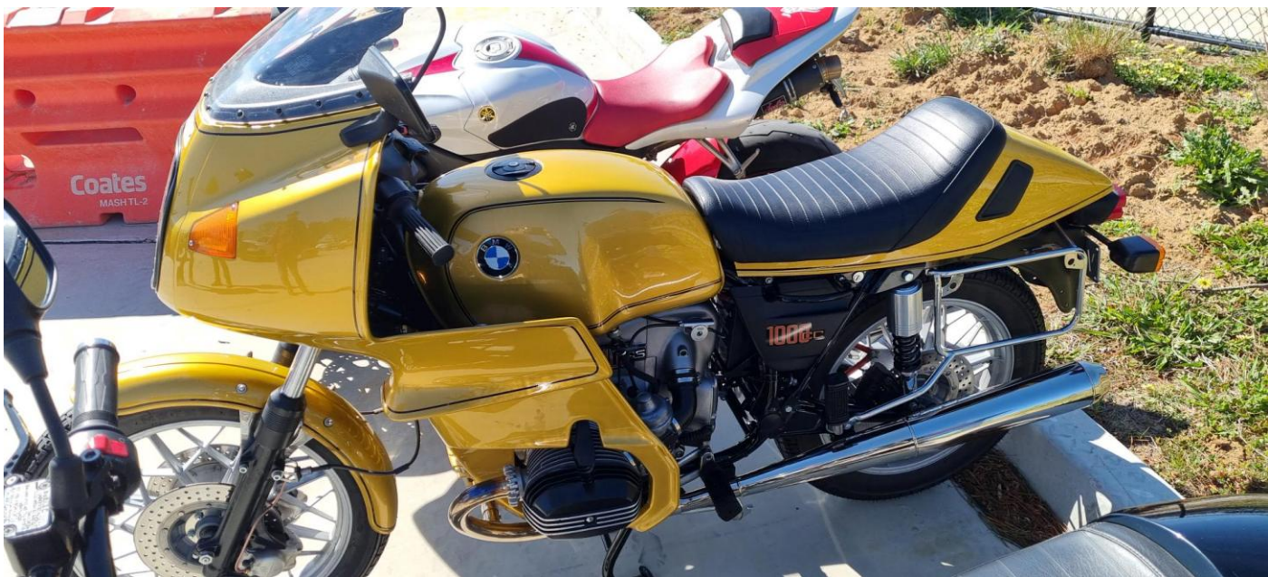
One Raceway Gouldburn