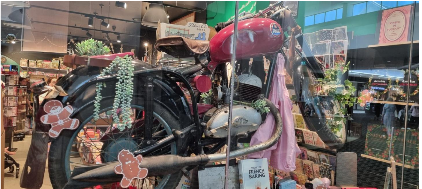
Window dressing at the Westfield Shopping Centre Carindale Qld