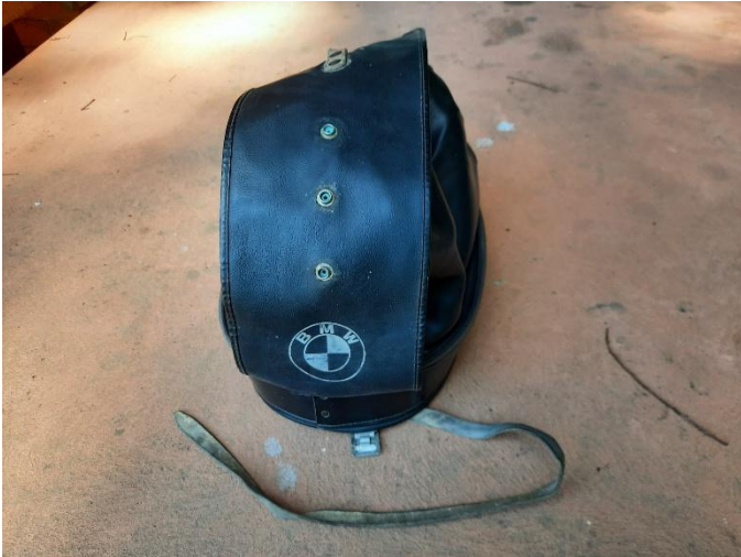
70's Tank bag