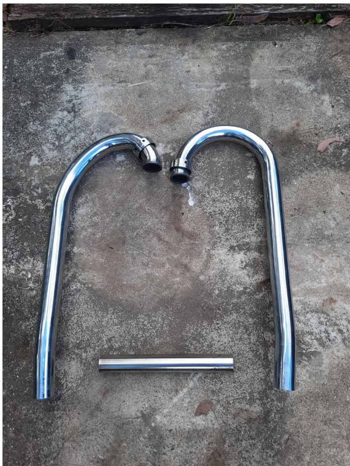
BMW R60 exhaust $500