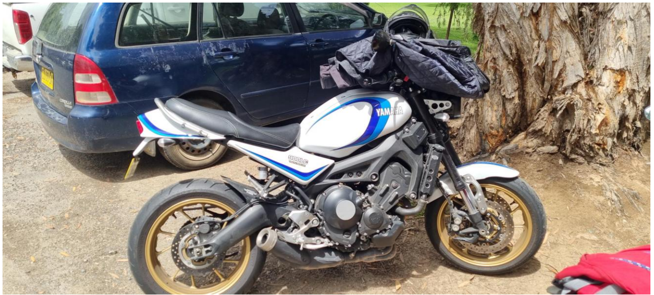
One of the Kempsey riders at the Butter Factory. Craigs RD350LC lookalike.