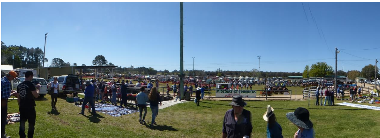
Panorama of the Rusty Iron Rally on Saturday Morning