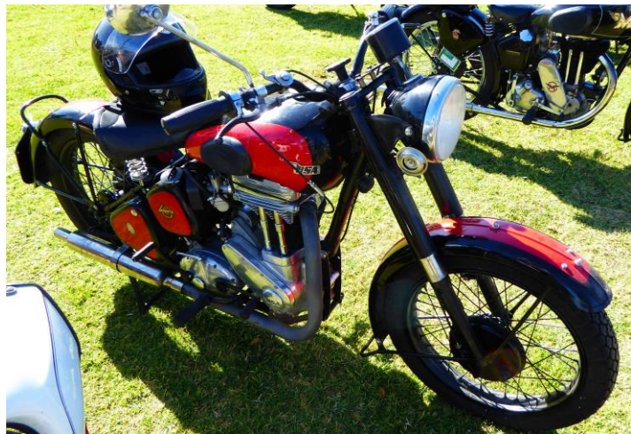
A BSA with an "identity crisis"