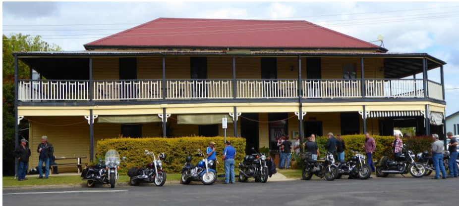
The lunch spot, Brushgrove Pub on the Clarence Valley Club's Grafton Rally,