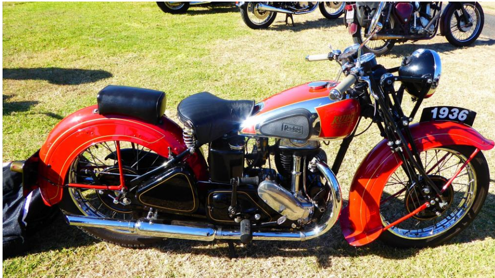
A category winning Rudge at the Grafton Rally.