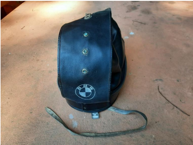
70's Tank bag