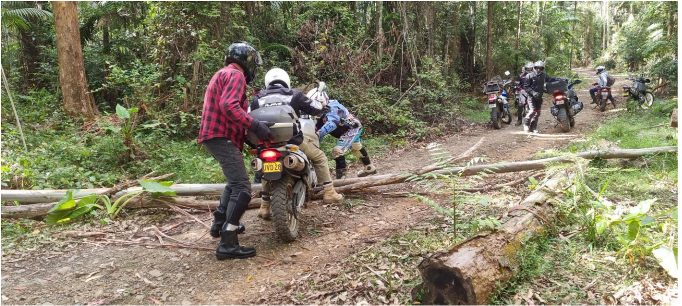
Caught between a stick and a side stand...