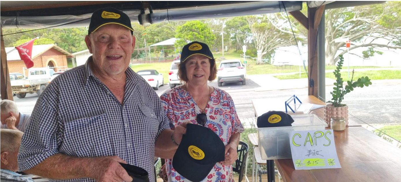
Check out our discounted clothing!