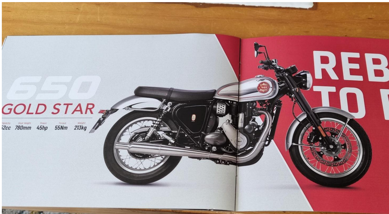
Coming to a "V"shop near you.