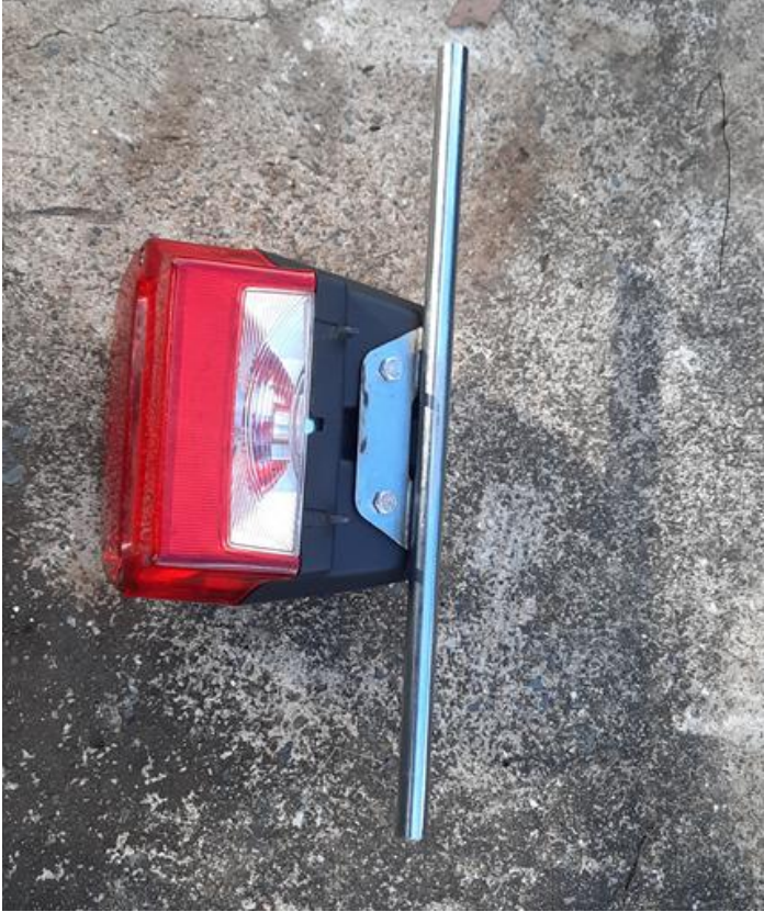
BMW Tail Light $100