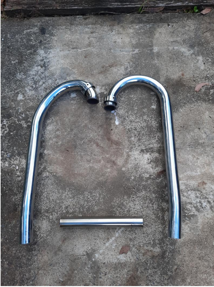
BMW R60 exhaust $500