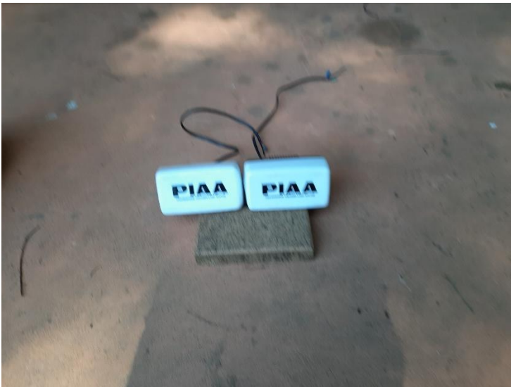
Driving lights $50

All BMW parts contact repopplewell@bigpond.com.au