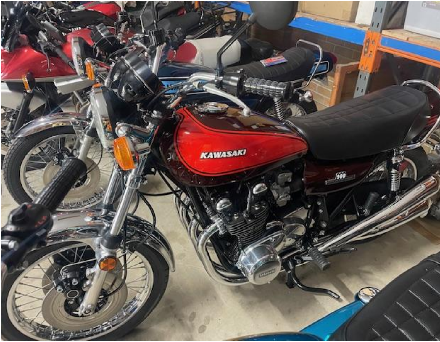
Dave Buckleys Show winner ●