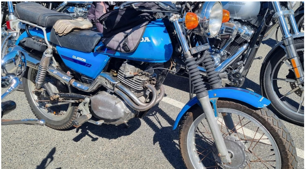
Pops unusual Honda Cl250s at North Beach.