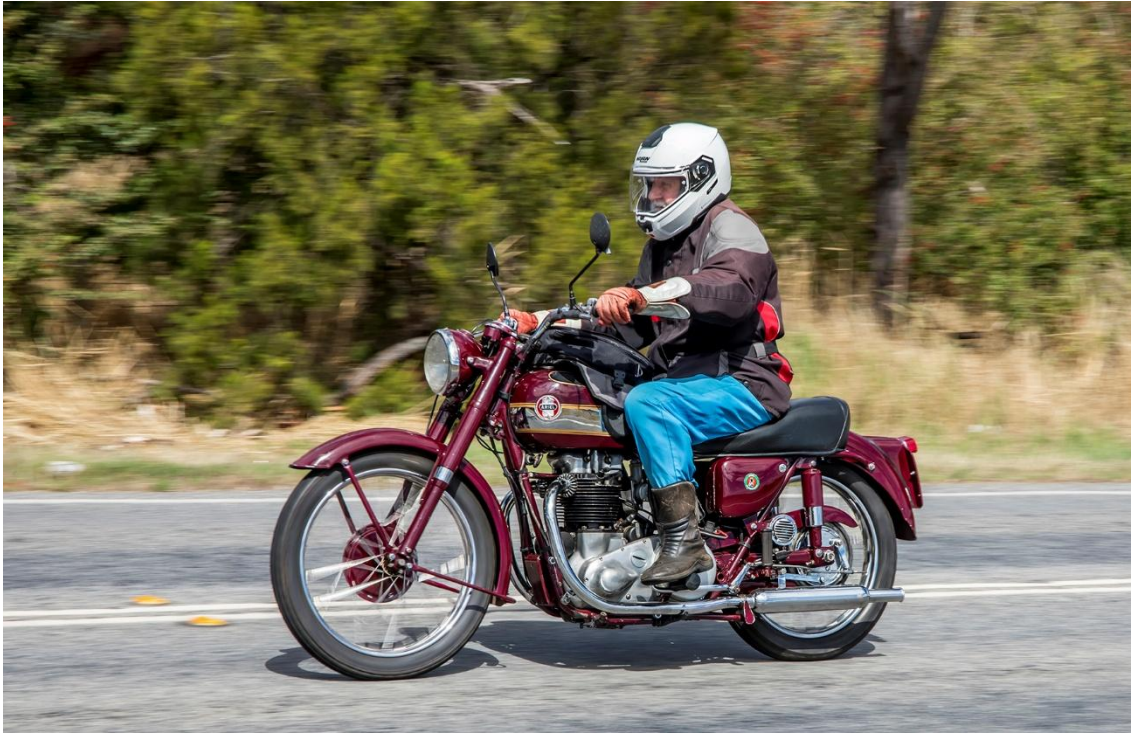
Rob's Ariel Huntmaster 650