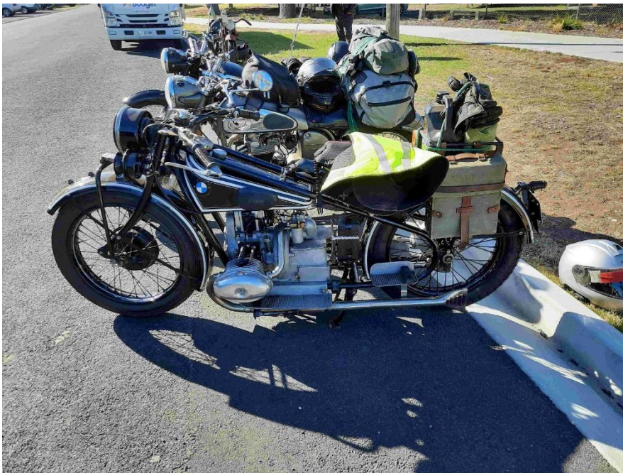
The oldest bike on tour, 1929 BMW