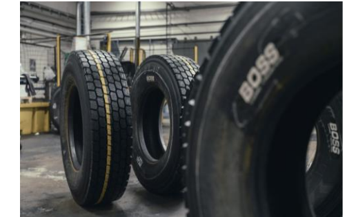
6. Quality control