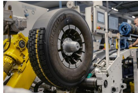
4. Application of new tread