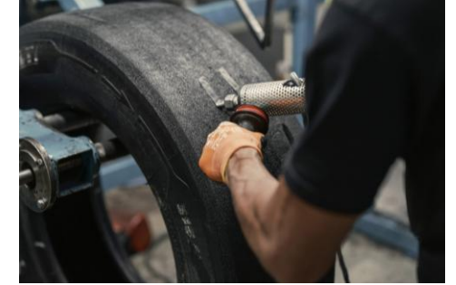
3. Repair of the tire casing