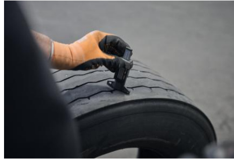
1. Inspection and selection of worn tires to be retreaded