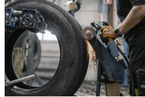
2. Buffing / removal of the old tread