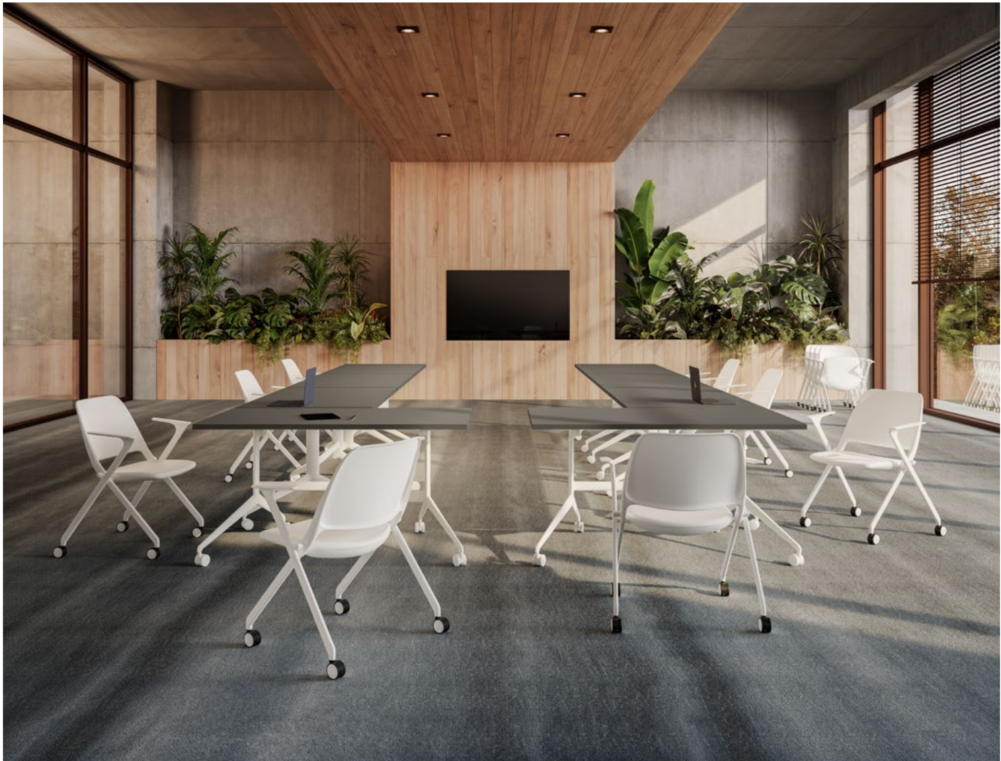
Zenith armless with casters