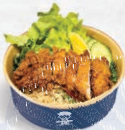
Thai Fried Rice