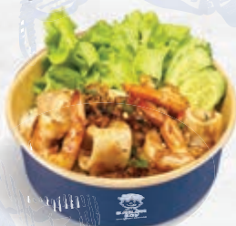
Salt-Garlic-Chilli with Rice