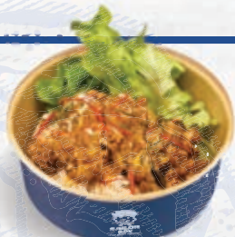
Panang Curry with Rice