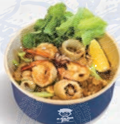
Pad Si Eiw