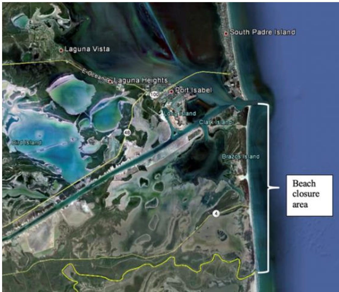
Exhibit B Boca Chica Beach Closure