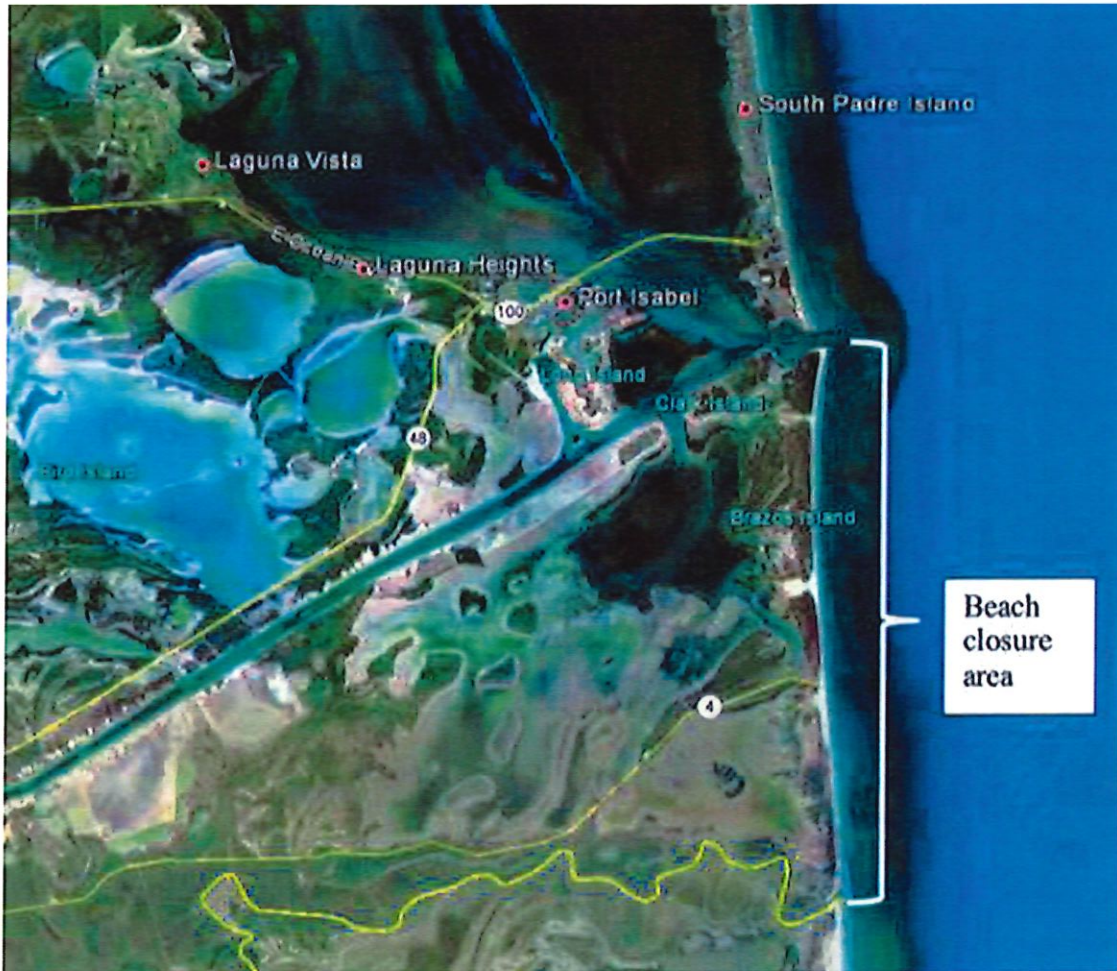
Exhibit B Boca Chica Beach Closure