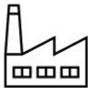
Industry & Built Environments