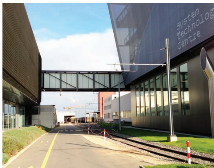
Nestle System Technology Centre | Orbe, Vaud, Switzerland Concept Consult Architectes