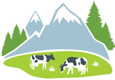
Fresh cow's milk from Swiss farms or cheese factories

The Swiss dairy industry meets high standards in terms of animal welfare, feeding, sustainability and social criteria.