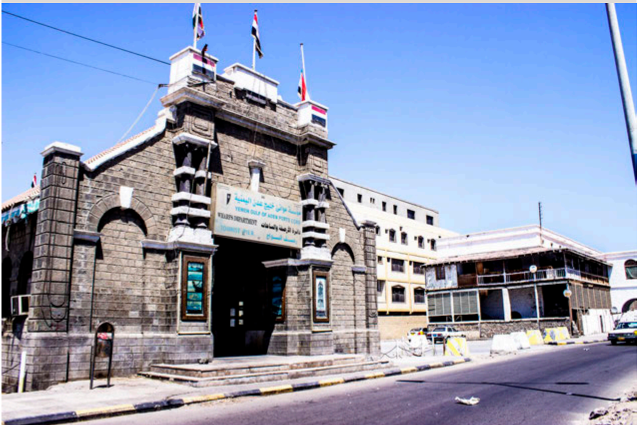
■ Touristic Pier in before the war – Aden

The pier is located in Al-Benjassar area in the Attawahi District in Aden Governorate and its minimum depth is four meters. The pier is characterized by the durability of its walls and its solid construction; since it was built with shamsani stone (relative to Shamsan Mountain). It also has a beautiful style, and an impressive scarlet roof, which mimics the construction model of the Indian port of Bombay.