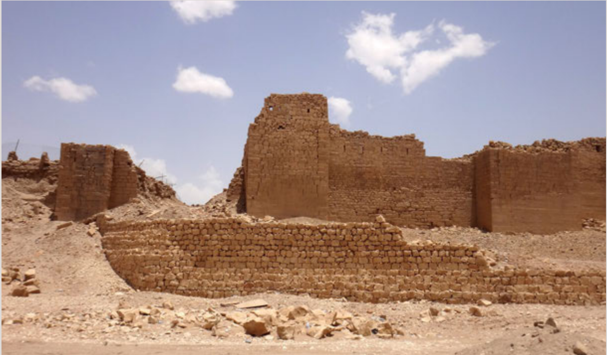
■ Wall of the historic town of Baraqish by: Saddam al-Adwar

Violations Committed by the Warring Parties against Yemen's Cultural Property