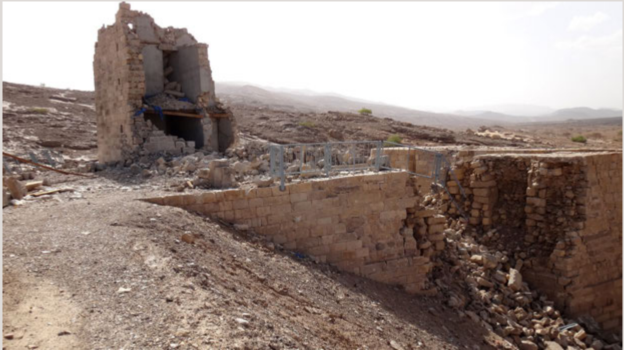
■ Northern gateway to the old Ma'rib dam by: Saddam al-Adwar