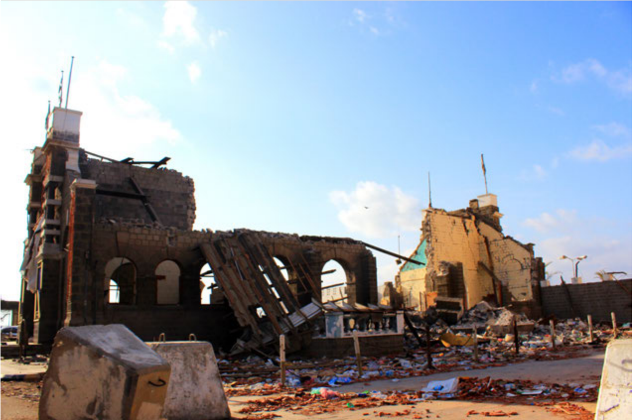
■ Touristic Pier after the war

The touristic pier was attacked several times, which led to its destruction. This happened during the war in Aden in early 2015, between the Ansar Allah group (Houthis) and their former ally Saleh on the one hand, and the popular resistance in the city and the Arab coalition forces led by Saudi Arabia and the UAE on the other hand.