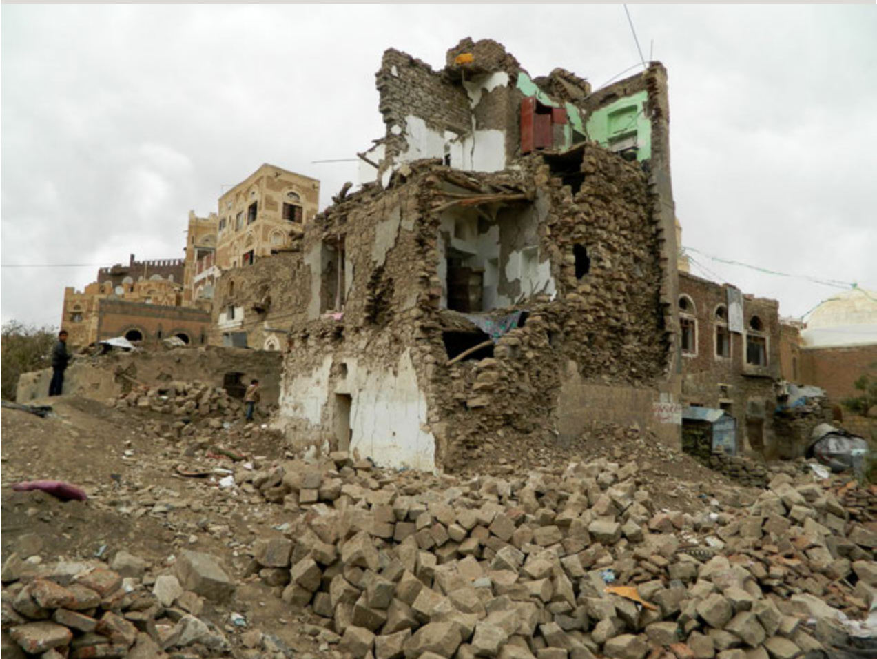
■ AL Foulaihy neighborhood in the old city of Sana'a

On Friday, September 18 th , 2015, at night, an aircraft of the Arab coalition led by Saudi Arabia and the UAE fired a bomb that targeted the house of citizen Hafez Allah Al-Aayni in Al Foulaiha neighborhood in old Sana'a. 13 people were killed in the raid, 10 of them from one family. The presence of military targets in the location targeted was not proved and confirmed to Mwatana.