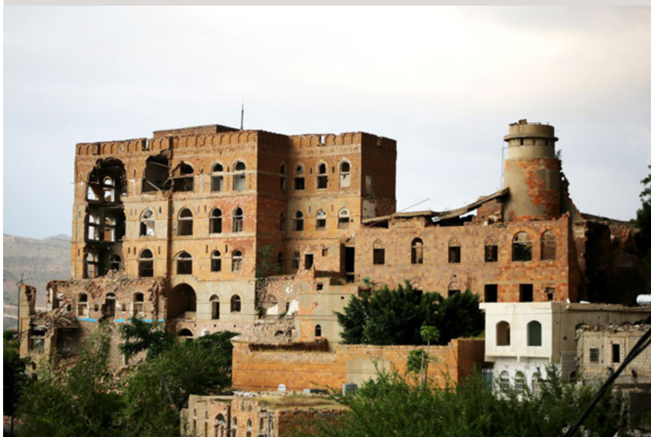
■ Salah castle – Taiz

The castle was built in the form of a fortress surrounded by a stone wall. Before today's ongoing war, it housed a small museum with a collection of ancient antiquities and some relics dating back to the Islamic era. The museum also contains exhibits of traditional craft products used in the last centuries of the second millennium. In addition, the Castle's Museum contained a collection of documents related to the most important internal and external events that had an impact on the modern and contemporary history of Yemen, which helped it gain great value among researchers, foreign tourists and visitors.