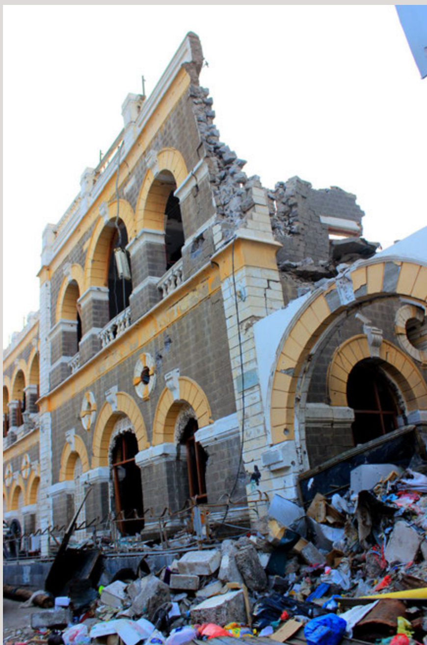
■ The Military Museum in the old city of Crater after the war – Aden

On July 15 th , 2015, the museum was subjected to an air strike carried out by the forces of the Arab coalition led by Saudi Arabia and the UAE. The raid partially destroyed some of its walls, cracked the rest of the walls and parts of the ceiling and the upper floor collapsed. The Ansar Allah fighters (Houthis) then left the museum building in frenzy. The museum was then looted and robbed, with many contents, mostly old and precious weapons, lost.