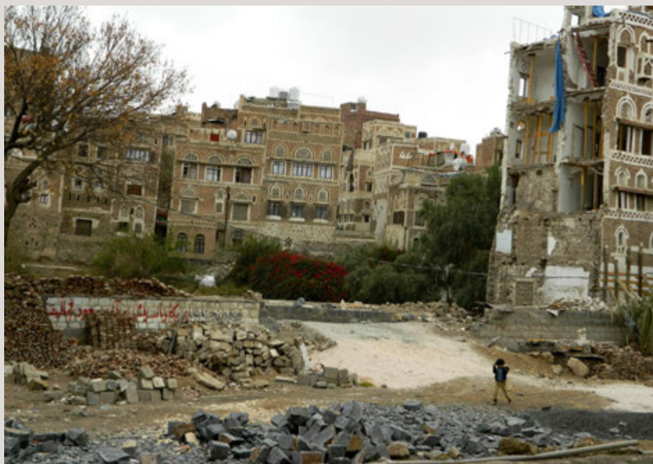
■ AL Qasimi neighborhood in the old city of Sana'a

"The Old City of Sana'a sustained serious damage due to armed conflict in the country. The neighborhood of al Qasimi near the famous urban garden of Miqshamat al Qasimi sustained particularly serious damage. The 12th century al-Mahdi Mosque and surrounding houses have also been affected."