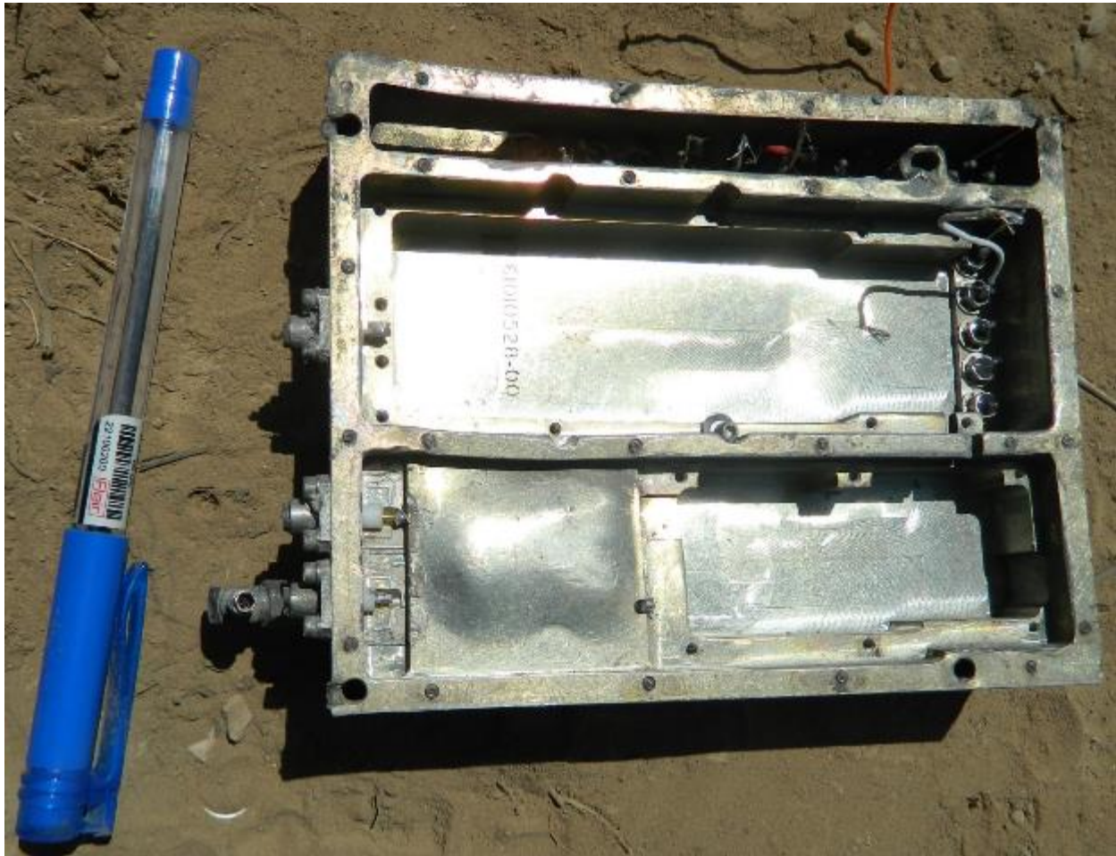
Remnants of the bombs.