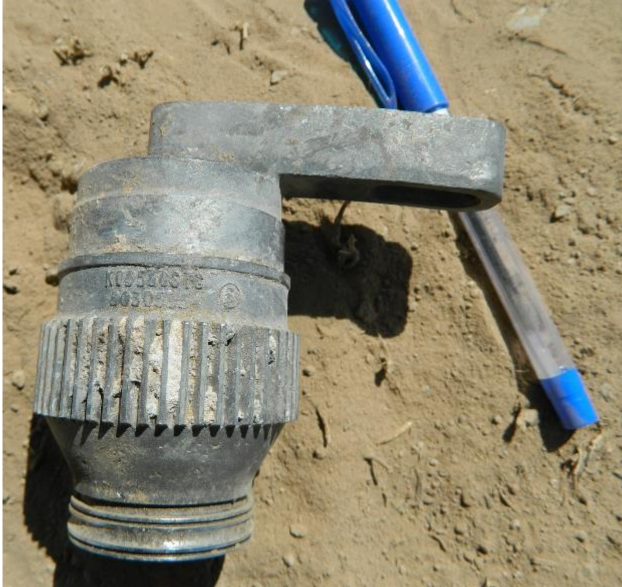
Remnants of the bombs.