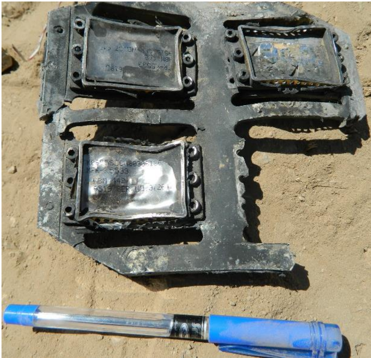
Remnants of the bombs.