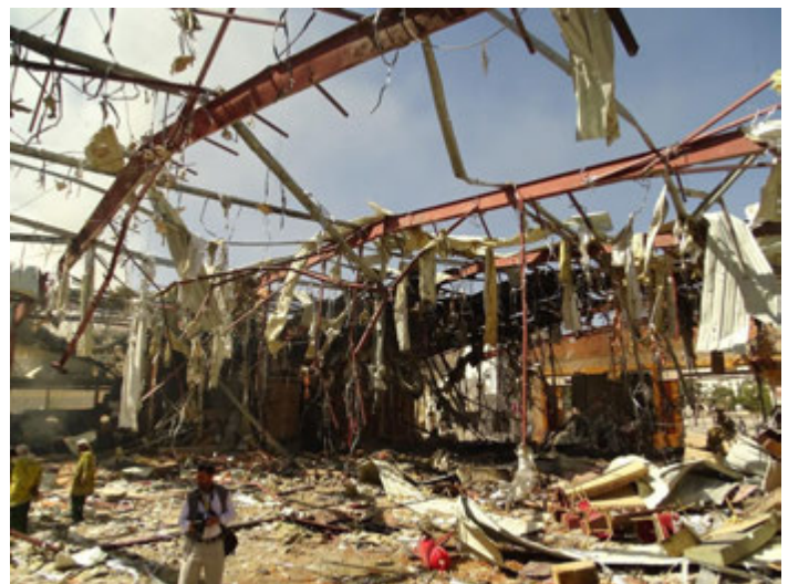
Destruction from October 2016 airstrike on funeral in As-Sabain District, Amanat Al-Asimah Governorate