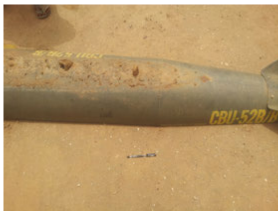
The US-made CBU-52 cluster bomb remnant recovered at the scene of the attack in Al-Sir village. The CBU-52 contains 217 BLU-61 submunitions that disperse indiscriminately and widely—across an area equivalent to over twenty-two football fields.