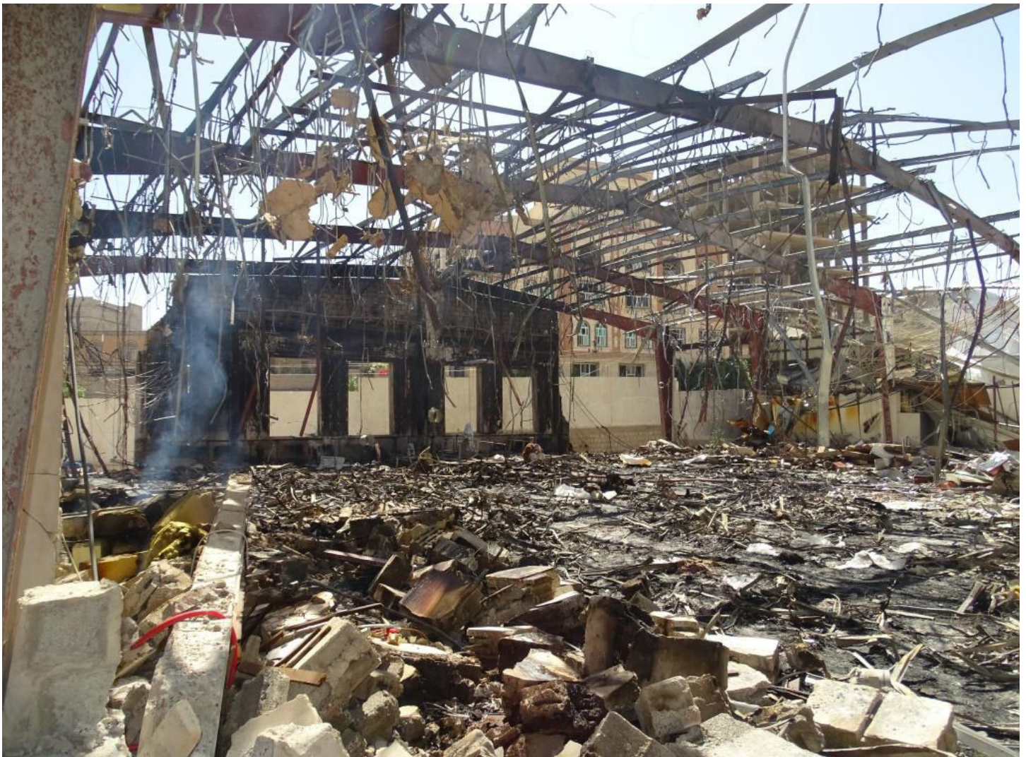
Scene from aftermath of October 2016 airstrike on funeral in As-Sabain District, Amanat Al-Asimah Governorate

Wounded in Amanat Al-Asimah Governorate October 2016