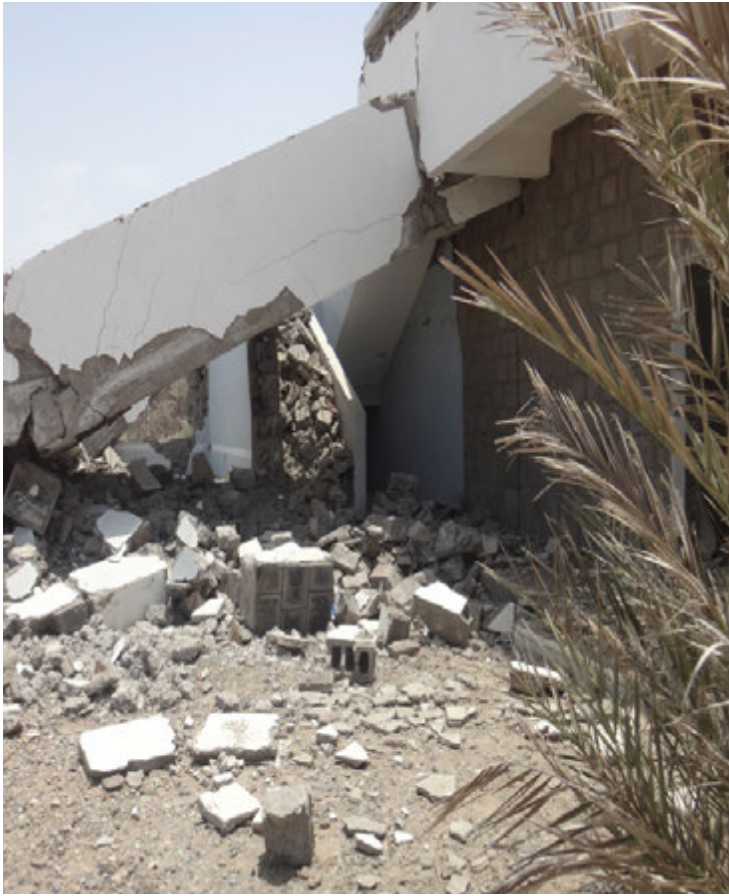
Destruction from airstrikes on Sheikh Ahmed Al-Faza Primary School in At-Tuhayat District, Hudaydah Governorate