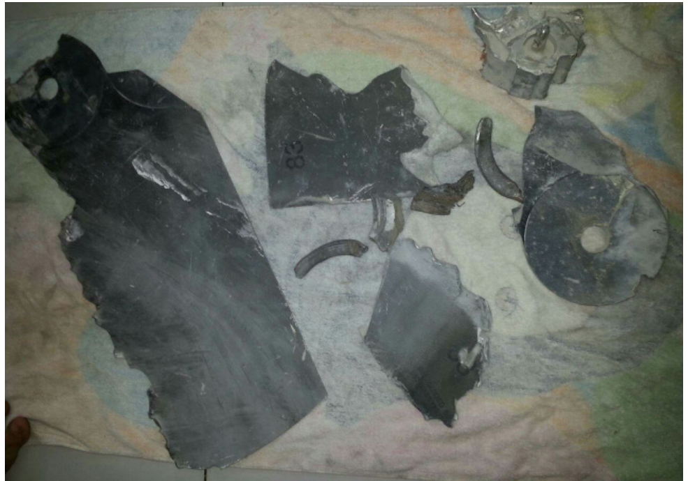
Remnants of a likely US-made Mk-83 warhead recovered at the scene of the attack on Al-Honood residential neighborhood.