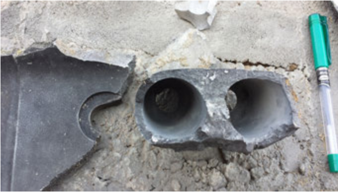
Remnants of a US-made GBU-12 Paveway II laser-guided bomb recovered at the scene of the wedding attack. Pen shown for scale.