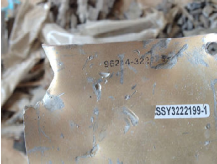
A remnant of a large guided bomb unit recovered at the scene of an attack on a civilian home in Amanat Al-Asimah Governorate (see Section II). The marking “96214” identifies US defense contractor Raytheon as the manufacturer.