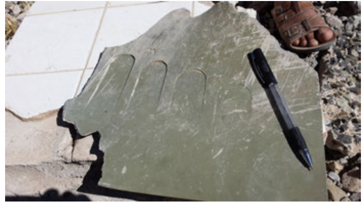
Remnants of a likely US-made GBU-24 Paveway III laser-guided bomb found at the scene of the attack on the Wa'lan Agricultural Complex. The photo on the right appears to show the forward fin of a guided bomb unit. The parallel indents with circular ends match the configuration of the GBU-24. The photo on the left appears to show the tail wing of a guided bomb unit. The two indents match the configuration of the GBU-24.

warned that the jets will strike again and didn't allow us to enter the building," Mohammed explained.