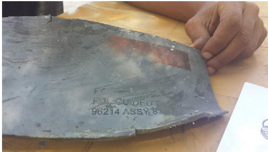
Remnant of a Raytheon-manufactured guided bomb unit recovered at the scene of the attack on the Cultural Center. The marking “96214” refers to US defense contractor Raytheon’s CAGE number.