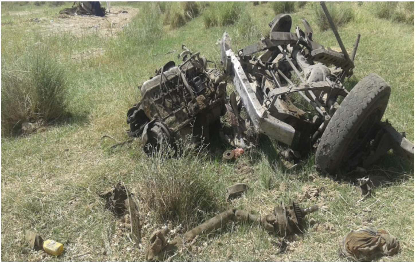
Remnants of the civilian pick-up truck struck in Al-Awlah valley.