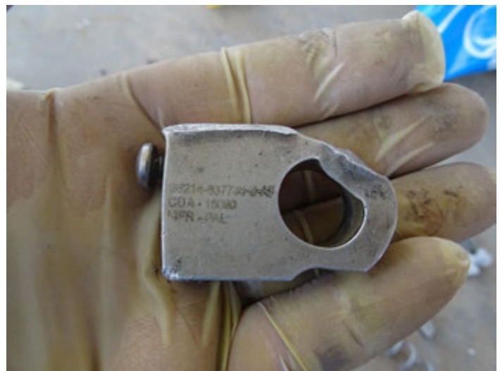
Remnants of a Raytheon-manufactured bomb recovered at the scene of a Coalition attack on a civilian factory complex (see Section II). The marking "96214" refers to Raytheon's CAGE number.

businesses both "avoid infringing on the human rights of others" and "address adverse human rights impacts with which they are involved." 141 These responsibilities exist independently of States' abilities or willingness to fulfill their human rights obligations. 142 In situations of armed conflict, businesses are expected to respect international humanitarian law. 143