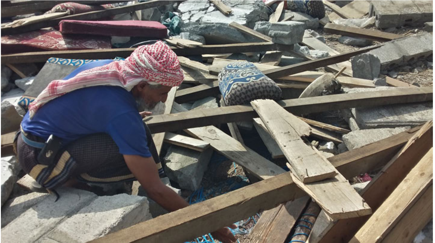
Man sorts through rubble after April 2018 airstrike on wedding in Bani Qais District, Hajjah Governorate.

edge that rendered future violations foreseeable. 60 According to the ICRC Commentaries, the positive obligation to “ensure respect” for the Conventions requires a due diligence process to mitigate or prevent violations when providing assistance to a warring party. 61 The Coalition’s repeated use of weapons provided by the US and European countries for attacks in violation of IHL, and the continued provision of weaponry despite the failure of attempted mitigation measures, indicate that these supporting States are violating their obligations to respect and ensure respect for the Geneva Conventions.