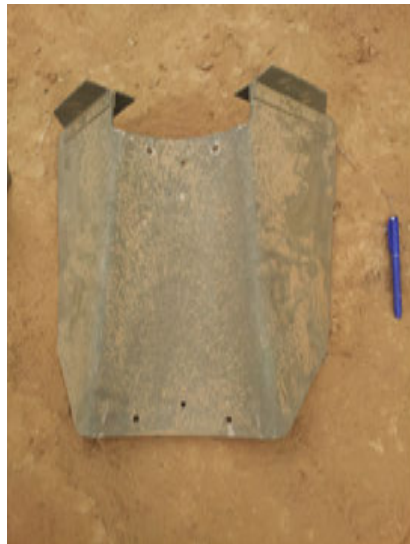
A remnant of a likely US-made CBU-58 cluster bomb used in the attack on Mohammed Saheli’s farm. The remnant pictured appears to be a tail unit of the bomb. The CBU-58 cluster bomb disperses about 650 BLU-63 submunitions widely and indiscriminately.