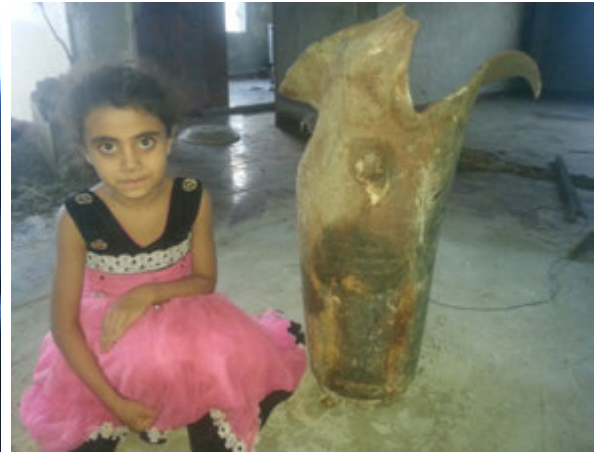
Remnant of a US-made Mk-82 bomb casing used in the attack on Hamoud Qayed's home (girl in photo on right shown for scale). The marking "BURKAN MUNITIONS SYSTEMS" indicates that the initially empty bomb was likely loaded with explosives at the ammunition factory of Burkan Munitions Systems, a UAE government company.

Systems. 7 Between 2010 and 2013, the US delivered 938 Paveway Guided Bombs to the UAE. 8 The Saudi/UAE-led Coalition has dropped US-made Mk-82 bombs on civilians and civilian infrastructure repeatedly since the start of the war. CNN reported that the Coalition used Lockheed Martin's Mk-82 Paveway bomb in a widely-condemned August 2018 airstrike on a school bus that killed dozens of children. 9 Ten of the twenty-seven apparently unlawful Coalition attacks documented in this report likely involved Mk-82 bombs.