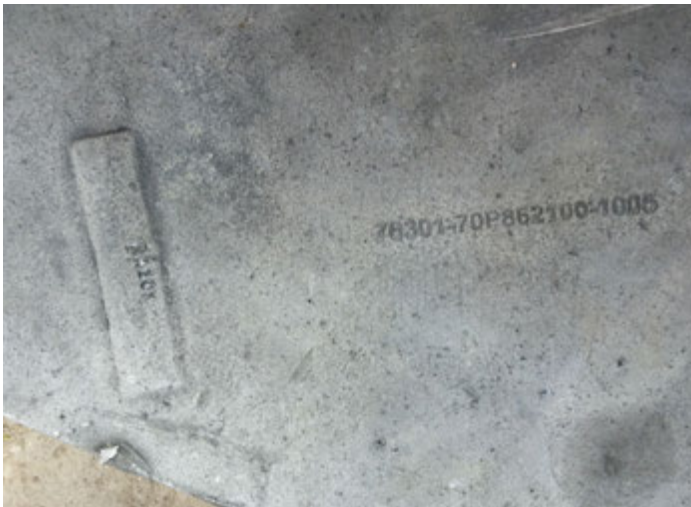
Remnants of a likely US-made JDAM GBU-31 bomb used in the attack that killed the Al-Sanabani family. The four securing holes pictured in the photo on the top resemble those of a JDAM GBU-31 tail fin. The marking “76301-70P86” in the photo on the bottom is associated with JDAM guidance part numbers.

and others, JIAT has reported that the Coalition did not carry out a strike despite clear physical evidence indicating an airstrike. 3