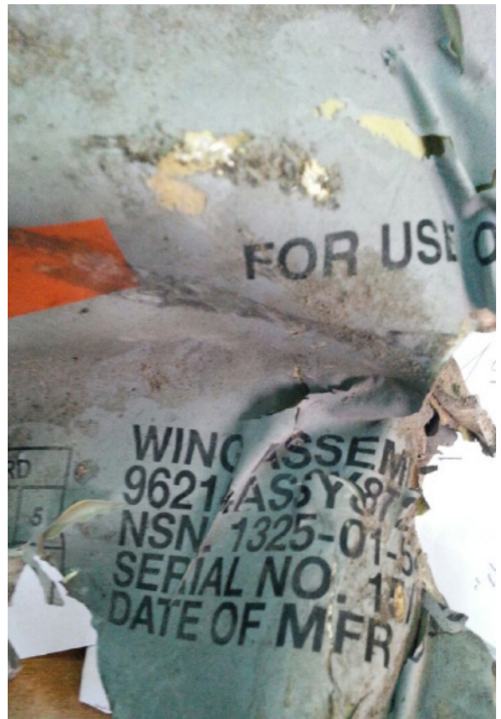
Remnant of a likely UK-made Paveway IV bomb (used with a US-made Mk-82 warhead) found at the scene of the attack on Derhim Industrial Factory. The markings on the remnant indicate that it is likely part of the Paveway IV bomb’s wing assembly. The marking “96214” identifies Raytheon as the manufacturer.

identity of Raytheon UK’s first and only export customer—undisclosed by the defense contractor—was confirmed to be Saudi Arabia. 9 In the third quarter of 2015, the UK approved £1 billion of export licenses to Saudi Arabia, a dramatic increase from the £9 million approved in the same period in 2014. 10 These deals included Paveway IV bombs originally meant for the UK Royal Air Force but delivered instead to Saudi Arabia, which reportedly needed to restock its supply of the bomb for use in Yemen. 11 In 2017, then-director general of security policy at the UK Ministry of Defence, Peter Watkins, revealed that the UK has trained Saudi air force personnel in the use of the Paveway IV. 12