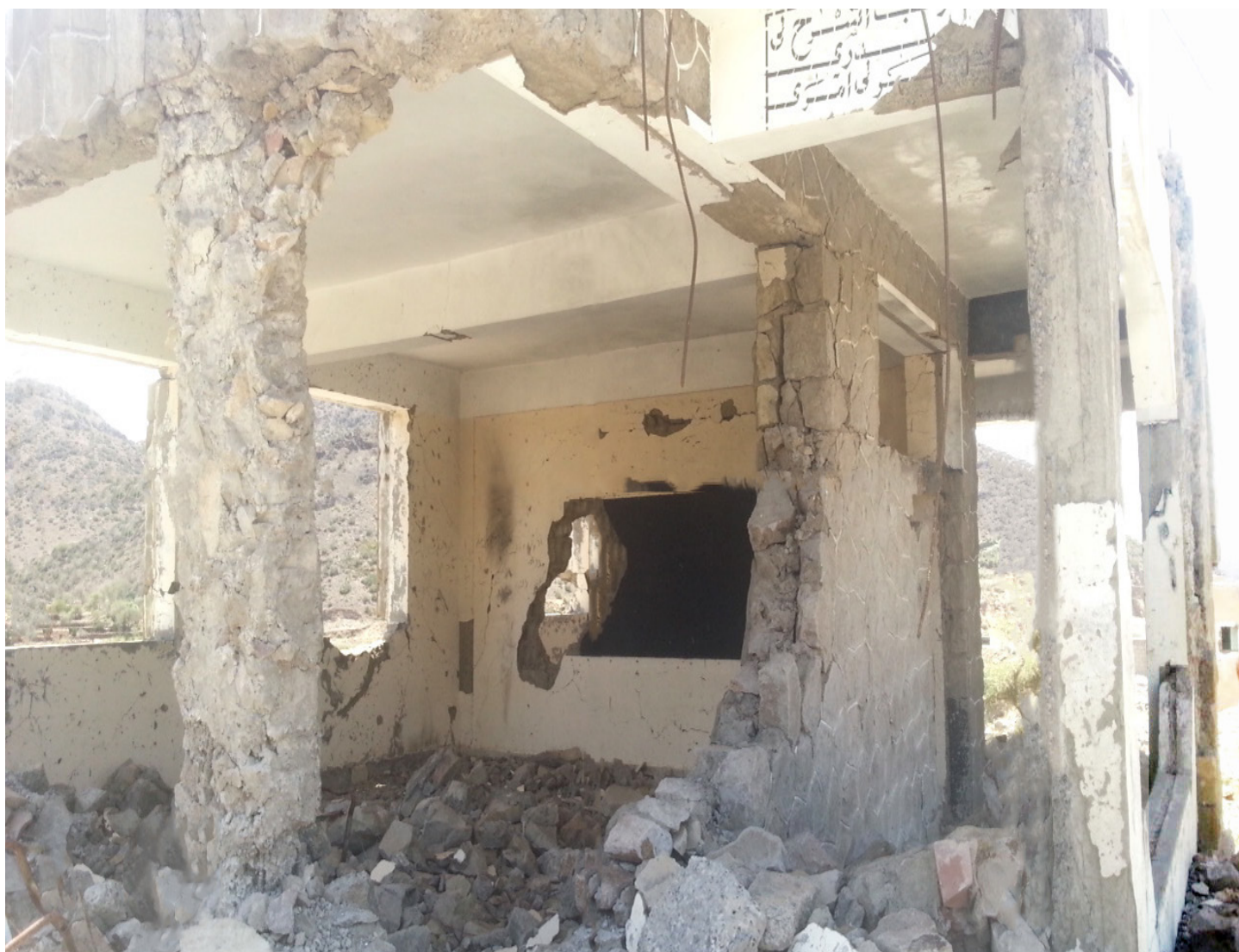
Scene from aftermath of June 2015 airstrike on Uqba bin Nafie School and Al-Masnah Health Clinic in At-Ta'iziyah District, Taizz Governorate

Eyewitness to attack in Taizz Governorate June 2015