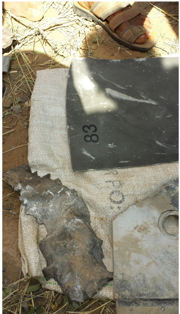
Remnants of a likely US-made Mk-83 warhead recovered at the scene of an attack in Bajil District, Hudaydah Governorate (see Section II).