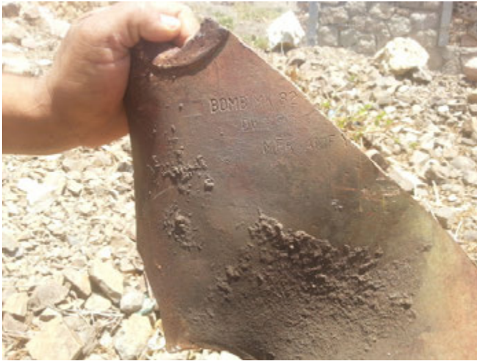
A remnant of a US-made Mk-82 bomb casing recovered at the scene of the attack on Uqba bin Nafie School and Al-Masnah Health Clinic.