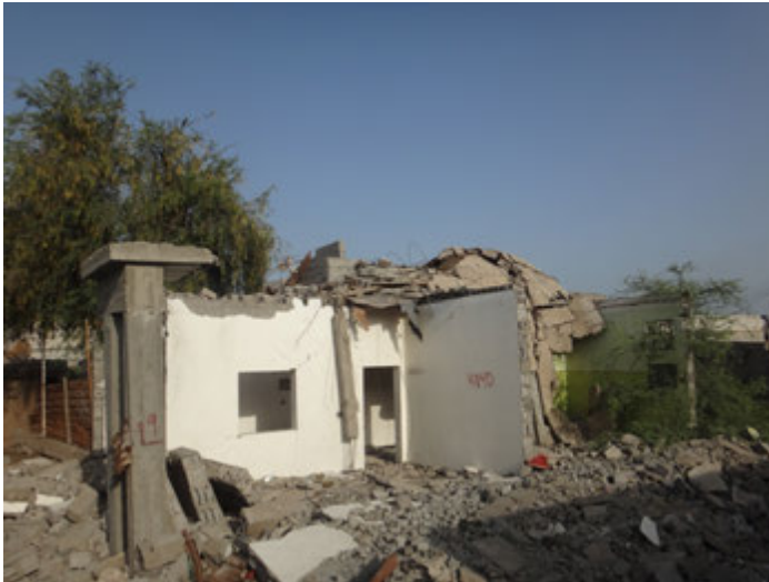
Destruction from April 2015 airstrike on civilian home in Dar Sa'ad District, Aden Governorate

On November 9, 2018, the US and Saudi Arabia announced that the US would cease refueling Coalition planes. 133 The countries ascribed the change to the Coalition’s enhanced capacity to handle its own refueling. However, observers have suggested that the announcement was a symbolic response to the murder of US-based journalist Jamal Khashoggi and increasing Congressional opposition to the war. 134 Although ending refueling assistance is a positive step toward US disengagement from the conflict and ful-