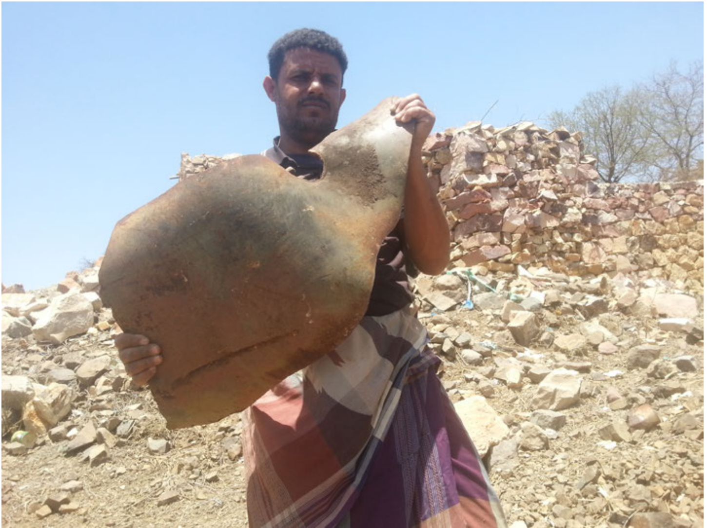
A man holds a remnant of a US-made Mk-82 bomb found at the site of a Coalition attack on a school and health clinic in At-Ta'iziyah District, Taizz Governorate (see Section II).

The United States has a long history of military cooperation with Saudi Arabia and the United Arab Emirates. Military cooperation between Saudi Arabia and the United States dates back to the 1950s, when the US built its first military base in the country. 1 Bilateral agreements in the 1950s and 1970s established the United States Military Training Mission in Saudi Arabia and the Saudi Arabian National Guard Modernization Program to oversee defense cooperation between the two countries. 2 The US and