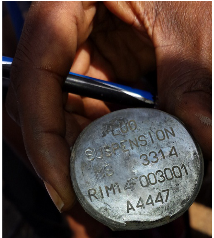
Remnants of a likely US-made GBU-16 bomb recovered at the scene of the attack in Dir Al Hajri village. The number 83 in the photo on the left appears to be associated with the Mk-83 warhead. The marking “MS3314” in the photo on the right is associated with 1000-pound bomb suspension lugs, which are consistent with the Mk-83.

posed sales of weapons to Saudi Arabia included $298 million for Paveway II and III, Enhanced Paveway II and III, and Paveway IV Weapons Systems. 4 Between 2010 and 2013, the US delivered 938 Paveway Guided Bombs to the UAE. 5