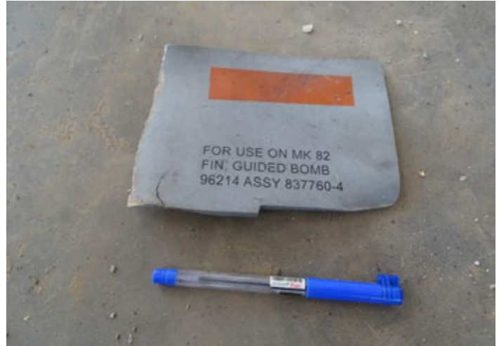
Remnants of a UK-made Paveway IV bomb found at the scene of the attack on Al-Senidar Factory Complex. As the remnant in the photo on the right indicates, a US-made Mk-82 warhead was mounted on the Paveway IV bomb. The marking “96214” on the remnant in the photo on the right identifies Raytheon as the manufacturer.

Mwatana researchers recovered a large remnant of a UK-made Paveway IV bomb at the site of the attack. The Paveway IV is a laser-guided bomb that modifies the US-made, 227-kilogram (500-pound) Mk-82 general-purpose bomb. 3 The Mk-82 contains 87 kilograms (190 pounds) of Composition H6, a highly explosive substance also used in the US Air Force’s so-called “Mother of All Bombs.” 4 The Mk-80 series of low-drag, general-purpose bombs are typically used to inflict maximal blast and explosive damage. 5 In August 2016, US defense contractor General Dynamics was awarded a multi-million dollar contract to supply Saudi Arabia and the UAE with Mk-82 bomb casings. 6