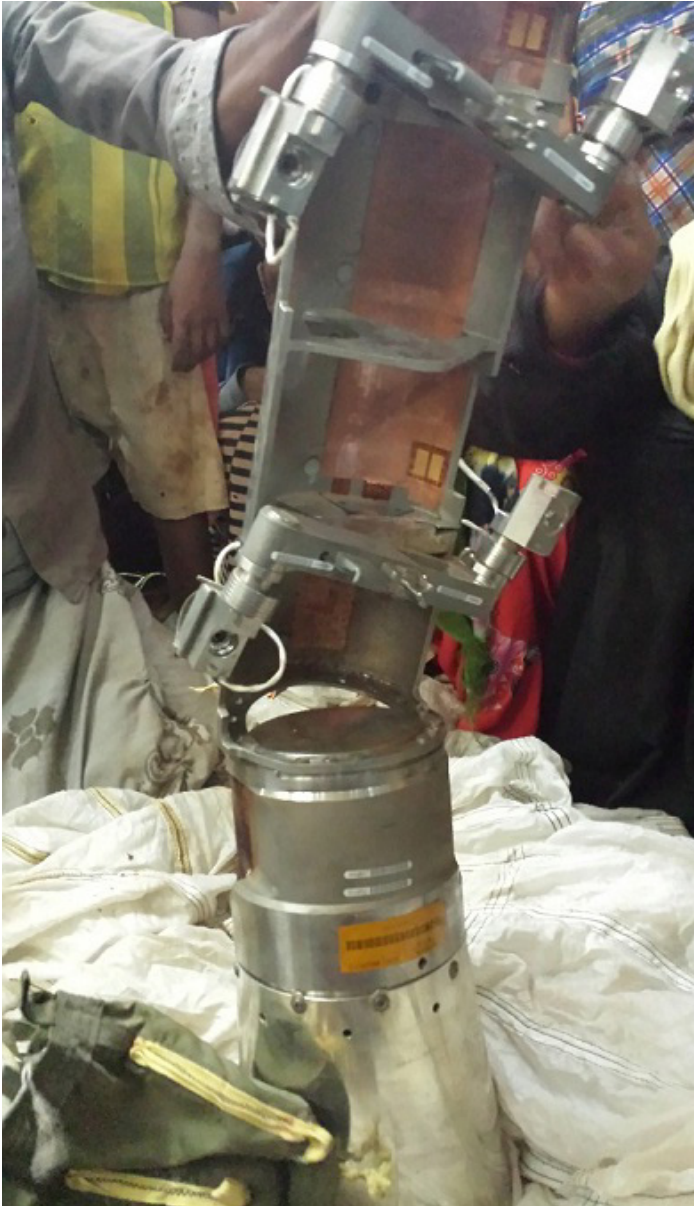
A stabilization unit of a BLU-108 submunition, recovered at the scene of the attack that killed Ali Mudarij. The marking “ASSY 856283,” visible in lower photo, is associated with the US-made CBU-105 cluster bomb, which releases BLU-108 submunitions. Each BLU-108 submunition contains four further “skeet” submunitions.

of 404 CBU-105s. 9 In 2010, the US sold the UAE $57 million of CBU-105s. 10 A Department of Defense (DOD) policy directive on cluster munitions prohibits the US from using or exporting cluster munitions that result in more than 1% unexploded ordnance and requires a commitment from the recipient of the cluster munitions to refrain from using them in civilian areas. 11 In 2011, the US asserted that the CBU-105 is the only cluster weapon that meets the 1% standard. 12 However, Human Rights Watch has documented multiple Coalition attacks in Yemen that resulted in BLU-108 submunitions with live skeet warheads attached. 13 Human Rights Watch has also reported multiple instances of Coalition use of the CBU-105 in civilian areas. 14