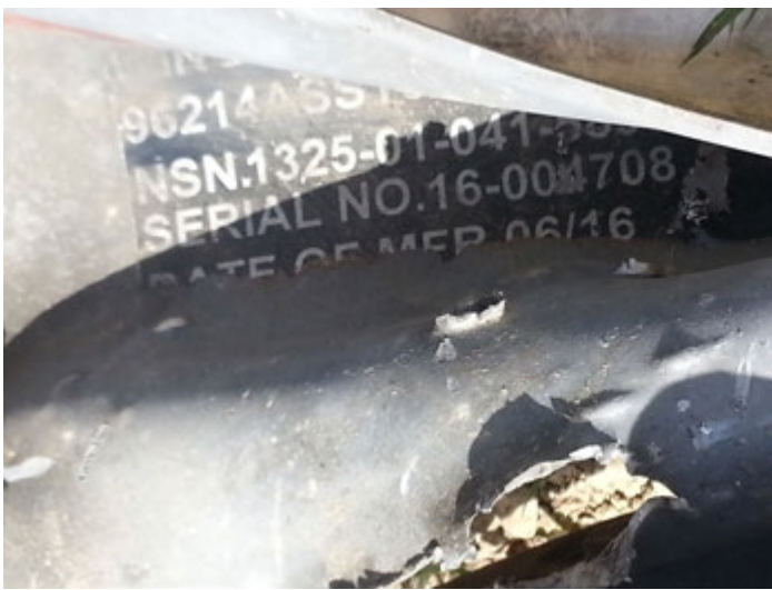
Remnant of the US-made GBU-12 wing assembly that struck the vehicle packed with children and women in Al-Awlah agricultural valley. The marking “96214” identifies Raytheon as the manufacturer. The marking “DATE OF MFR 06/16” indicates that the wing assembly was manufactured in June 2016.

the 15 civilians. 1 JIAT claimed that the Coalition had intelligence indicating the vehicle was carrying leading Houthi commanders 2 and that “secondary explosions” took place when the Coalition struck the vehicle, “meaning that the vehicle was carrying weapons and ammunition along with the Houthi commanders.” 3 JIAT’s findings are entirely inconsistent with the evidence gathered by