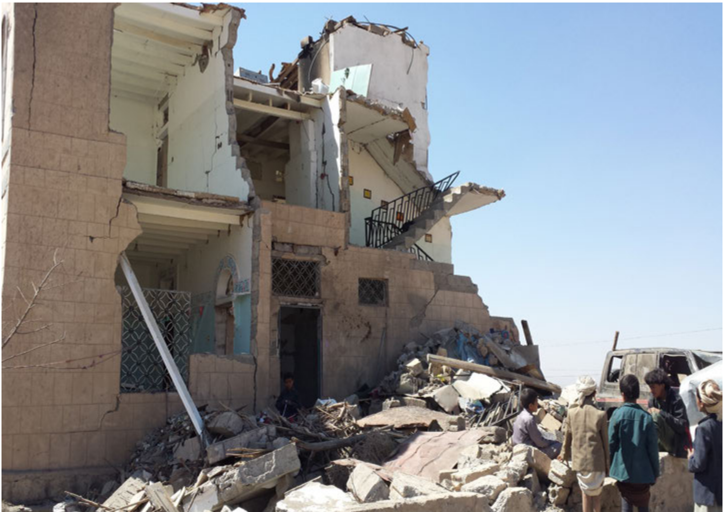
Scene from aftermath of September 2015 airstrike on Wālan Agricultural Complex in Bilad Ar-Rus District, Sana'a Governorate

Wounded in Sana’a Governorate September 2015