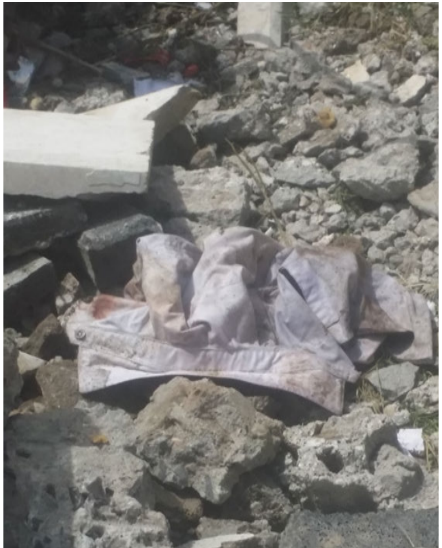
A tuft of human hair and a bloodied shirt, both believed to have belonged to 3-year-old Dhia Al Duais or 4-year-old Muhammed Al Duais. Both children were killed in the attack, their bodies mangled.