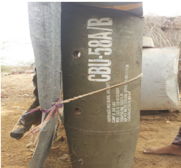
A US-made CBU-58 cluster bomb casing recovered at the scene of the attack in Bani Haddad village. The CBU-58 cluster bomb disperses about 650 BLU-63 submunitions widely and indiscriminately.