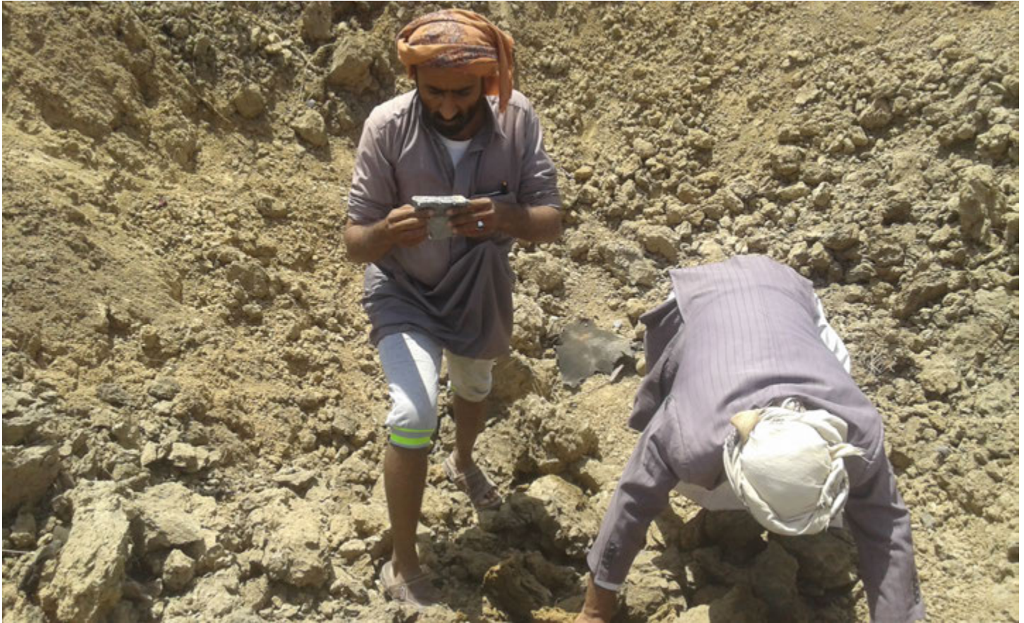
Residents search for weapons remnants after September 2016 airstrike that killed twelve children and three women in Al-Matmmah District, Al-Jawf Governorate (see Section II).

numbers of cluster munitions to Saudi Arabia. In August 2013, the countries concluded a contract for 1,300 CBU-105 Sensor Fuzed Weapons, cluster munitions made by Textron Defense Systems, to be delivered by December 2015. 42 The countries had previously, in 2011, announced a deal for the sale of 404 CBU-105s. 43 The US notified Congress of several transfers of cluster munitions to Saudi Arabia before 1995, including 1,000 CBU-58, 350 CBU-71, 1,200 CBU-87, and 600 CBU-87 cluster bombs. 44 Reports of US-made cluster munition use in the ongoing conflict in Yemen include CBU-105, CBU-58, CBU-87, and M26 rocket