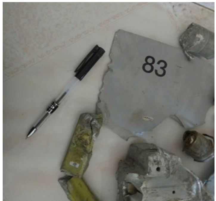
Remnants of a US-made Mk-83 warhead found at the scene of the attack on Al-Kahlani Factory. The Mk-83 warhead is associated with the GBU-16 Paveway II bomb. Left: The marking "8,000 PSI" is consistent with the gas containers of a number of GBU forward control units, which are pressurized to 8,000 PSI. The marking "252746-5" is associated with Raytheon aircraft parts.