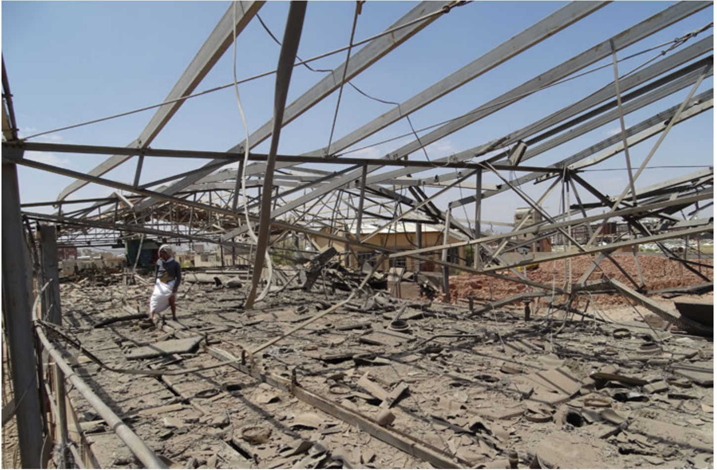
Man walks through rubble after September 2016 airstrike on Al-Senidar Factory Complex in Bani Al-Harith District, Amanat Al-Asimah Governorate.

which struck civilian structures, including homes, a farm, and a fishing boat—were foreseeable. The US should adhere to its own policy directives, a growing international consensus against cluster munitions, and IHL prohibitions on indiscriminate attacks and reinstate a ban on the export of cluster munitions to Saudi/UAE-led Coalition countries.