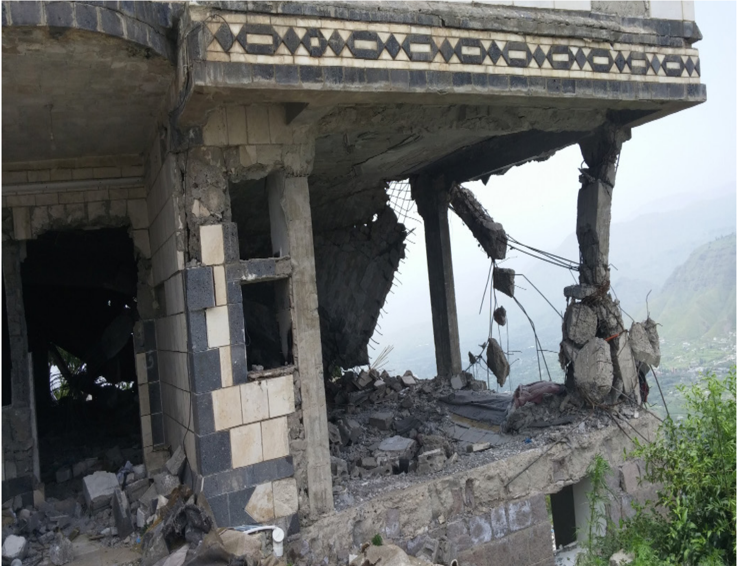
Damage from August 2015 airstrike on civilian homes in Al-Dhibar District, Ibb Governorate

the benefit of their sustenance value is forbidden. 14 Although targeting such an object may be permissible if an opposing party is using the object in direct support of military action, any attack that is expected to result in starvation or forced displacement of the civilian population is prohibited. 15