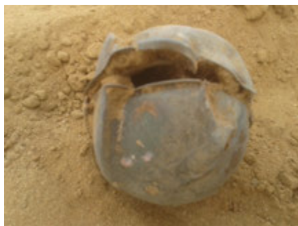
A US-made BLU-63 submunition released from a cluster bomb in the attack that killed 10-year-old Ahmad Mansour's mother and siblings.