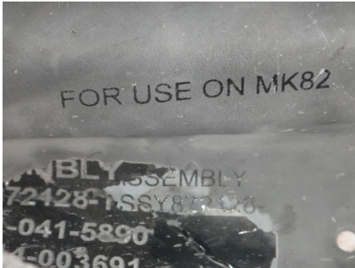
Remnant of a US-made GBU-12 Paveway II bomb used in an attack on a civilian home in Dar Sa'ad District, Aden Governorate (see Section II). As the marking "FOR USE ON MK82" indicates, an Mk-82 warhead was mounted on the GBU-12 bomb. The marking "1325-01-041-5890," parts of which are visible in the photo, is associated with a Raytheon-manufactured wing assembly.

military assistance to Saudi Arabia and the UAE.