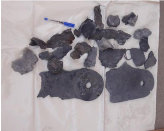
Weapons remnants recovered at the scene of the Sana'a funeral attack. Pen shown for scale. A US-made GBU-12 Paveway II bomb was identified by Human Rights Watch as one of the weapons used in the attack.

cause incidental loss of civilian life or damage to civilian structures that is excessive in relation to the attack's anticipated concrete and direct military advantage, it is unlawfully disproportionate. Hundreds of civilian casualties were the entirely foreseeable result of the Coalition's attack on the densely packed, public funeral gathering. Laws of war violations carried out intentionally or recklessly are war crimes.