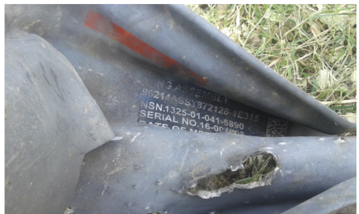
Remnant of a US-made GBU-12 wing assembly recovered at the scene of an attack that killed fifteen civilians, including twelve children, in Al-Matmmah District, Al-Jawf Governorate (see Section II). The marking “96214” identifies Raytheon as the manufacturer.