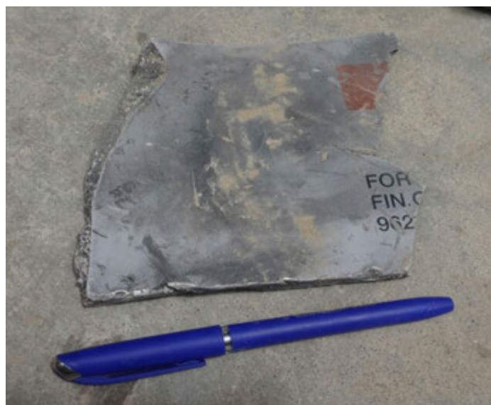
A remnant of what appears to be a guided bomb unit found at the scene of the attack on Al-Khansa Girls' School. The marking "962" appears to be the initial digits of US defense contractor Raytheon's CAGE number (96214), likely identifying Raytheon as the manufacturer of the part.

The Saudi/UAE-led Coalition attack appears to have been indiscriminate. Researchers and witnesses did not identify any