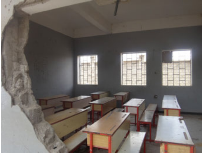
View of destroyed exterior of Asma'a bint Abi Bakr School in Al-Mansuriyah District, Hudaydah Governorate after August 2015 airstrike

of their own activities, but also expected to “seek to prevent or mitigate adverse human rights impacts that are directly linked to their operations, products or services by their business relationships...” 144 Each business is expected to put in place an ongoing due diligence process to identify, prevent, and mitigate adverse human rights impacts. 145 When a business identifies adverse human rights impacts connected to its activities, it is expected to take appropriate action, such as using its leverage to cease or mitigate the adverse impact 146 or ending its business relationship. 147 If a business finds that it has “caused or contributed to adverse impacts,” it is expected to provide for or cooperate in the remediation of these impacts. 148