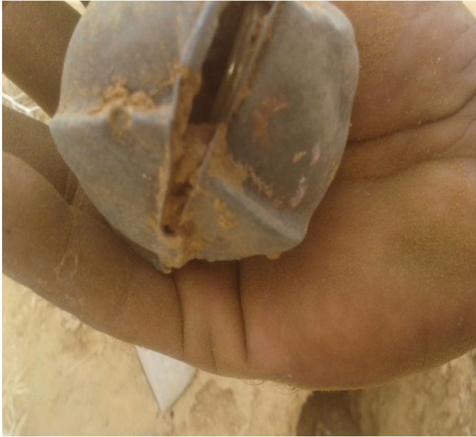
A US-made BLU-63 submunition found at the scene of an attack that killed fifteen civilians, including nine children, in Midi District, Hajjah Governorate (see Section II). BLU-63 submunitions are generally released from the CBU-58 cluster bomb, which disperses 650 of the submunitions widely and indiscriminately.

failed to operationalize solutions JIAT recommends. 24 Moreover, JIAT has investigated a small portion of the incidents that human rights organizations and international bodies have identified as likely violations of international humanitarian law, including only a small fraction of the 27 apparently unlawful attacks documented in this report. 25 Publicly released JIAT investigation results absolve Coalition members of responsibility in the vast majority of attacks—contrary to the results of independent fact-finding. 26 JIAT has failed to investigate certain alleged IHL violations altogether and made no effort to determine individual criminal responsibility for war crimes. 27 In the few cases in which JIAT has recommended further investigation or compensation for victims, there is no evidence of credible follow-up by Coalition states on the recommendations. 28 As currently constituted, this body does not meet the standards necessary to fulfill Coalition countries' requirements