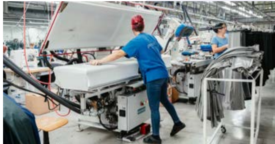
Indupress High-performance pressing line