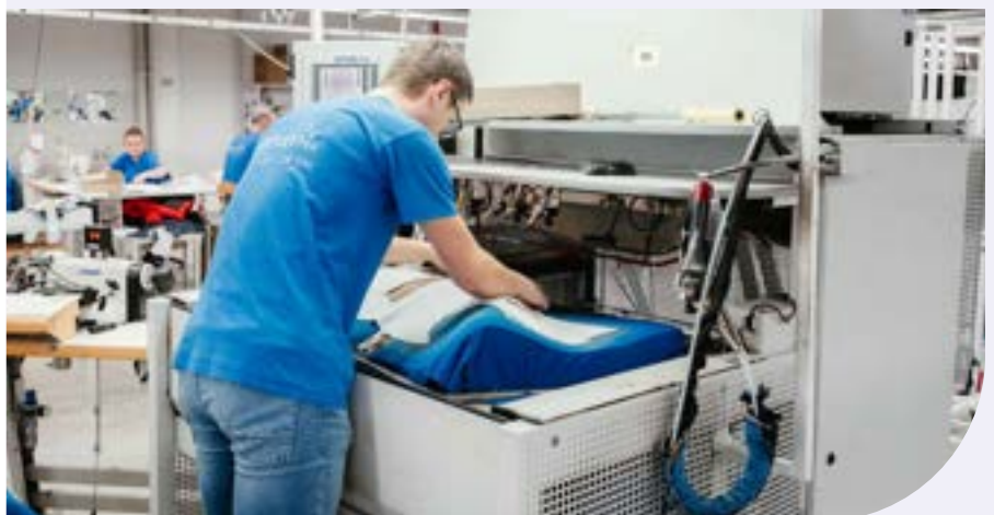
Veit Brisay High-performance pressing line