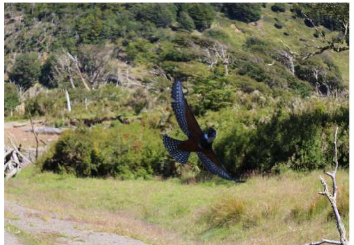
Humboldt Penguin, (Cachagua Island)