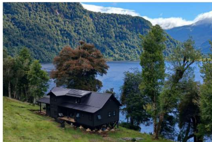
Private Mountain Cabin