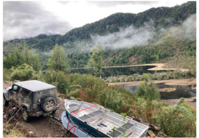
Pristine valleys and dramatic peaks