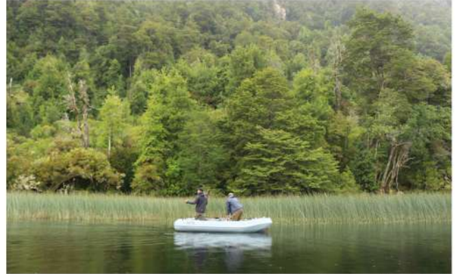
Exploring the Forest on Horseback.