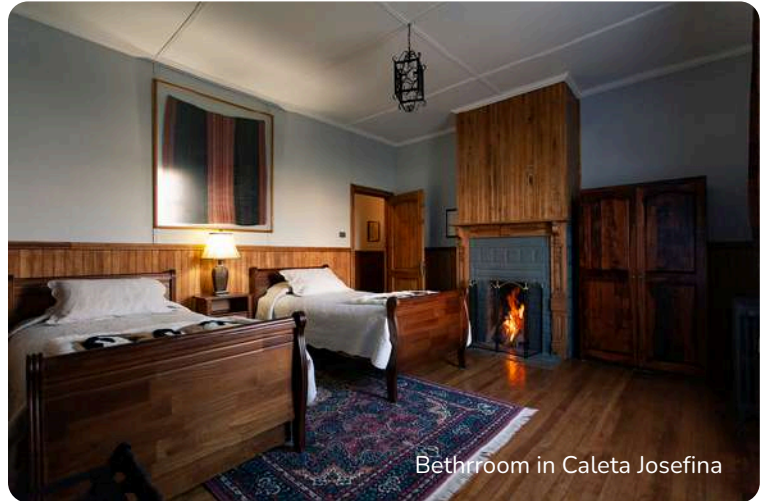
Bethroom in Caleta Josefina