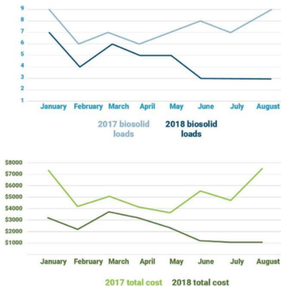
SOUTH DEERFIELD BIOSOLIDS LOADS AND HAULING COSTS (2017 VS. 2018)

I cannot think of anything else I could do or add into our treatment picture for such a small monetary outlay that would also reduce our biosolids this significantly. This has been a very simple solution to our escalating sludge-hauling problem and has made a significant positive impact on controlling those costs, while giving us no more bulking, no rising solids in our clarifier, excellent denitrification, very low nutrient numbers, and single digit TSS and BOD values without any infrastructural changes or additions whatsoever.