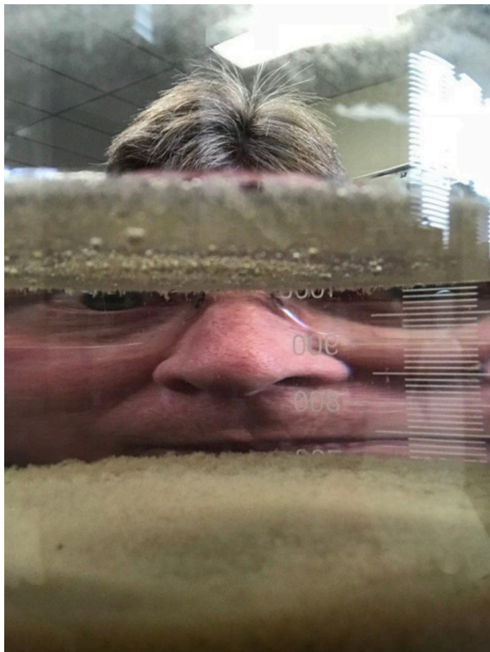
Top shelf clarity on the effluent produced by using Aqua Assist.

This whole experience has been pretty remarkable. It's taught me – and allowed me the latitude – to