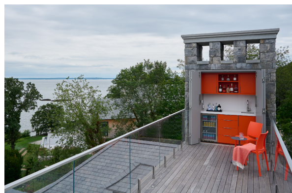
Best Exterior Feature was awarded to the sleek, modern rooftop bar with colorful orange accents pictured above right. It offers a 360 degree view of the water, and is equipped with an electrically operated roof hatch.