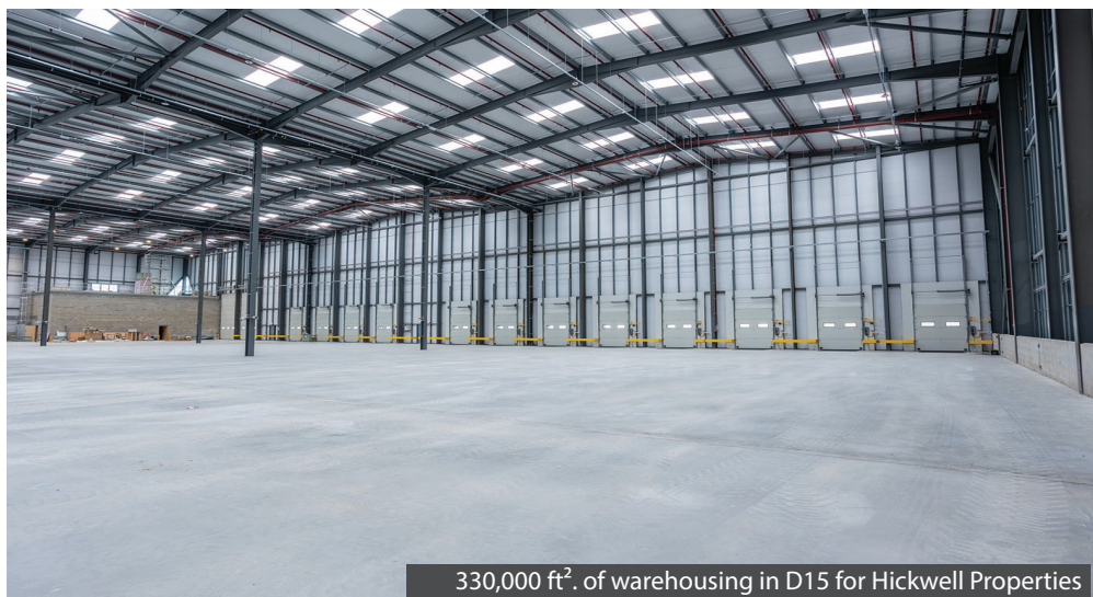
330,000 ft 2 . of warehousing in D15 for Hickwell Properties

A state-of-the-art, two-storey extension to St Patrick's Classical School, Navan, County Meath – which was officially opened in November 2024 – was in the running for two 2025 Building & Architect of the Year Awards.