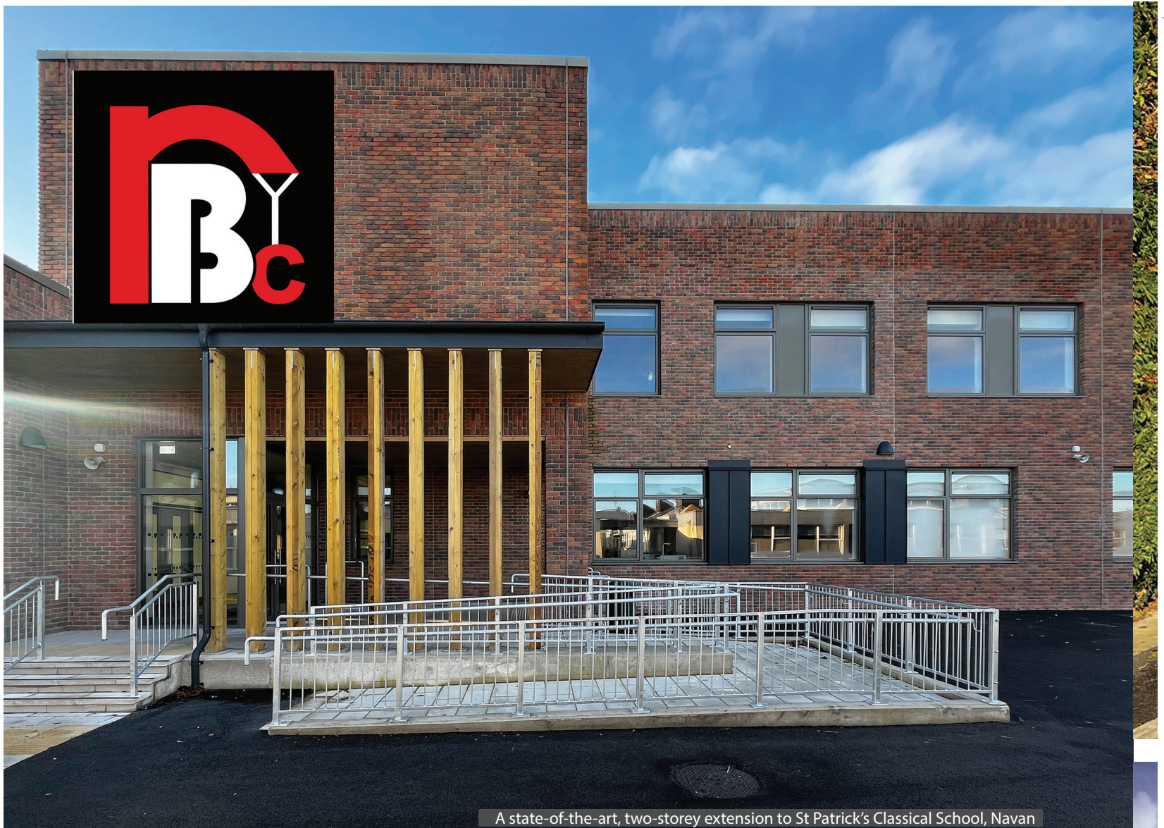
A state-of-the-art, two-storey extension to St Patrick's Classical School, Navan