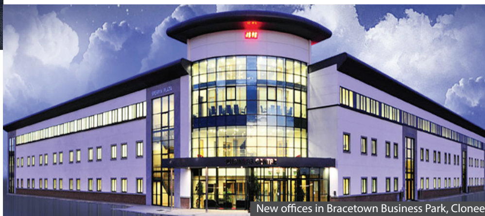
New offices in Bracetown Business Park, Clonée