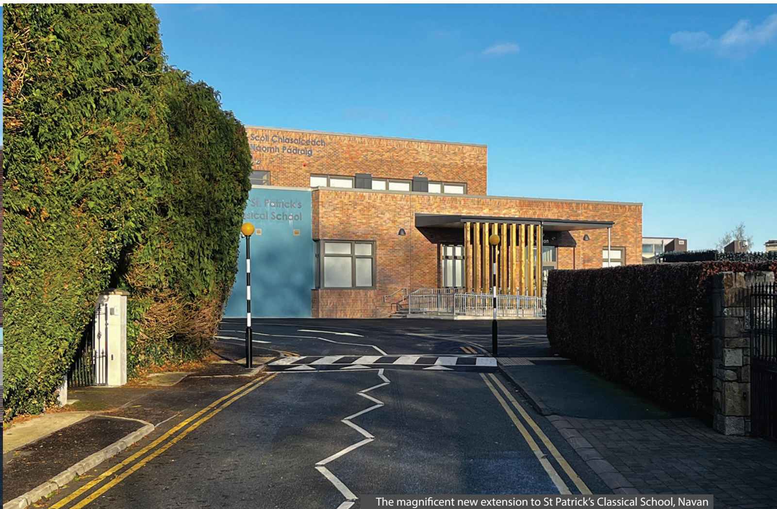
The magnificent new extension to St Patrick's Classical School, Navan