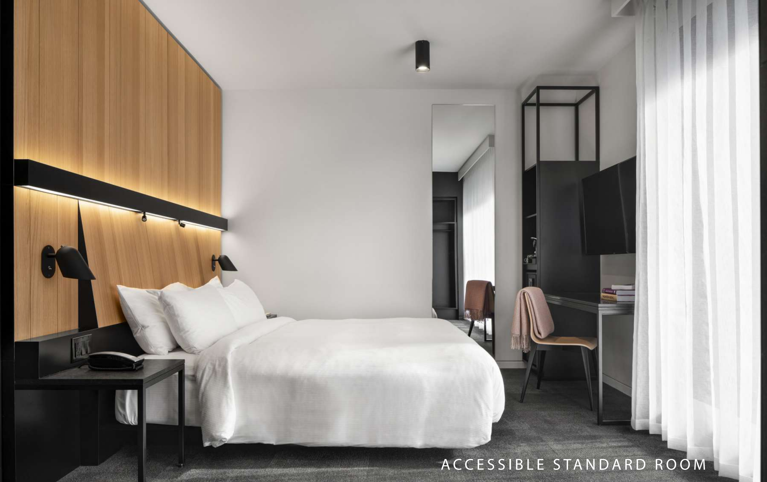
ACCESSIBLE STANDARD ROOM