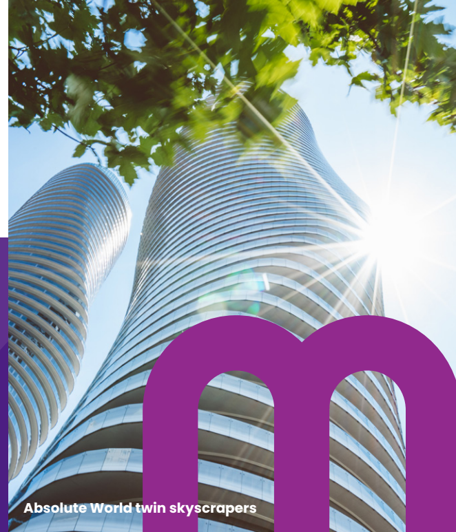
Absolute World twin skyscrapers

Mississauga is a young, welcoming city with diversity woven into its fabric. People from across the globe have made Mississauga home and are integral to the exciting transformation taking place in this sprawling metropolis that reaches from Pearson International Airport southward to historic villages situated along the Lake Ontario waterfront. A positive entrepreneurial vibe is evident at every turn, from the city's modernization programs to a flourishing arts scene, vibrant cultural celebrations and global cuisine.