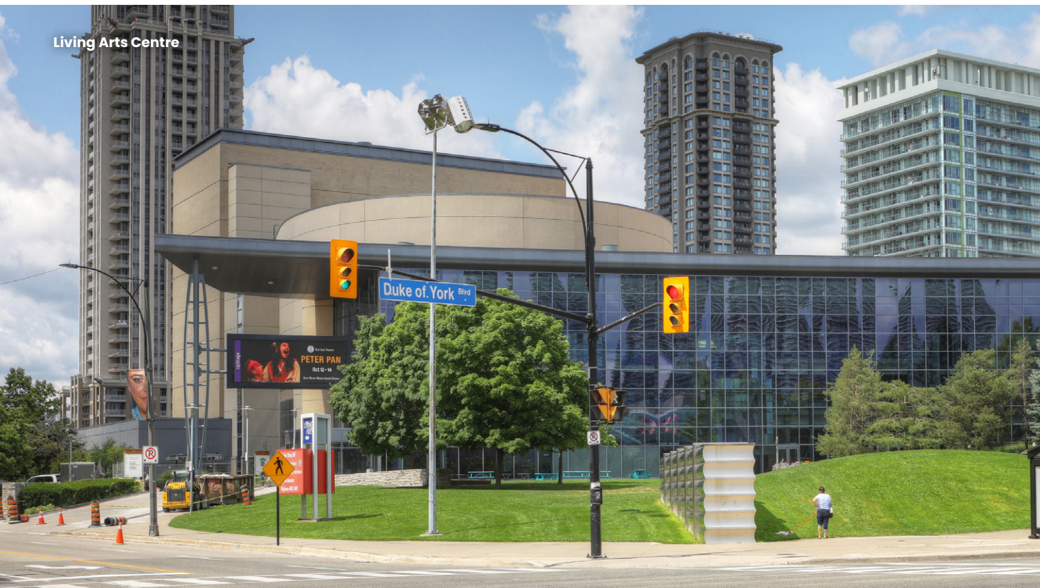
Living Arts Centre

Mississauga Convention Centre is a highly flexible venue featuring seven interior halls, a stunning foyer, landscaped grounds and space to host up to 2,400 guests.