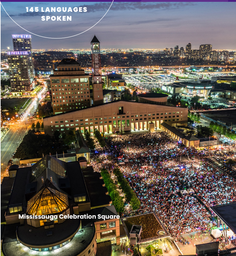
Mississauga Celebration Square