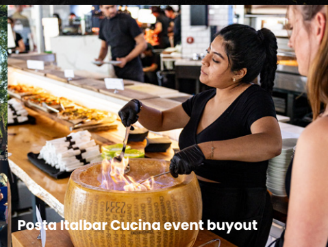
Posta Italbar Cucina event buyout