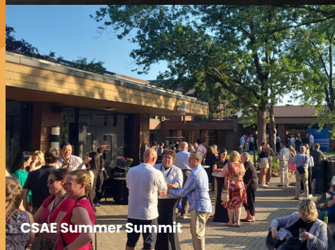
CSAE Summer Summit

Mississauga boasts abundant green space and waterways, including the stunning Credit River