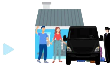
Temporary Housing Drop-off