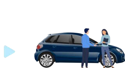
Rental Car Pick-up