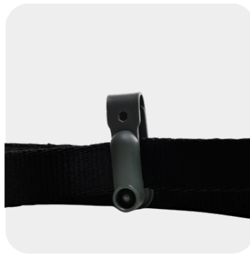
✓ 1" / 25 mm Webbing