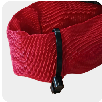
✗ Load-bearing area