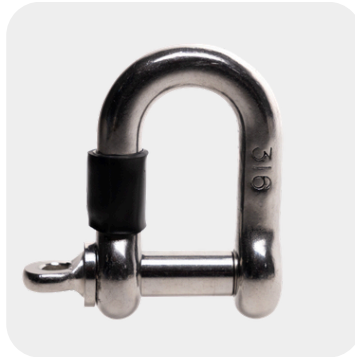
✓ Heatshrink over round surface