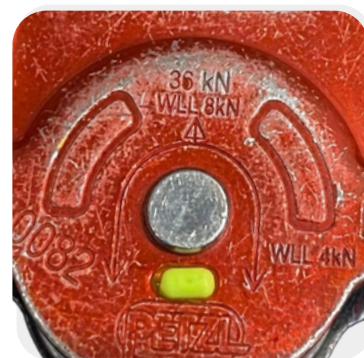
✗ Too proud