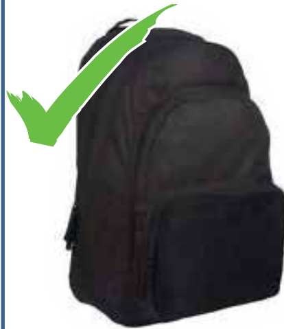
Acceptable because it is a plain black rucksack.

The rucksack must be able to hold an outdoor coat, A4 journal, P.E. kit and the compulsory stationery that all students must have for school. The compulsory stationery includes: a black/blue pen, a green pen, a pencil, a whiteboard pen, whiteboard rubber and a ruler. The rucksack must be carried using both straps. If it is raining students should have a carrier bag to place their coat in to avoid the contents of the rucksack getting wet.