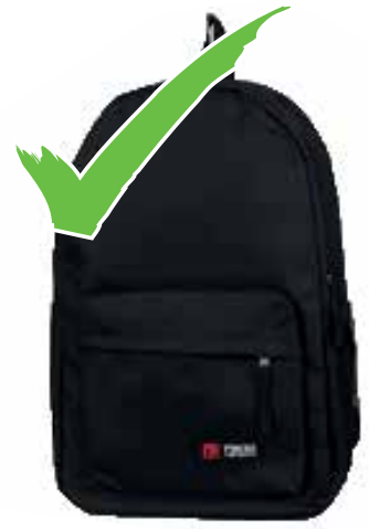
Acceptable because it is black in colour and the logo is small.

If a student attends without an acceptable rucksack, the school will provide a Lift Kingswood carrier bag for the student to carry their equipment on that day. Any student not in possession of either a rucksack that complies with policy, or a Lift Kingswood carrier bag, will be placed in reflections. Please find above examples of recommended bags that meet our policy.