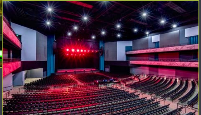
Coca Cola Music Hall