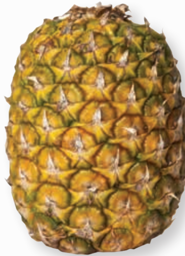
GOOD BUT WATCH CAREFULLY FOR SPOILAGE