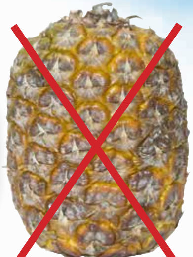
SHOULD NOT BE DISPLAYED FOR SALE

Our research tells us that consumers have differing ideas about what stage they like to eat their pineapple. Never display pineapples that are dark brown in colour, are soft or weeping or that have dark spots, bruises or mould on the skin.