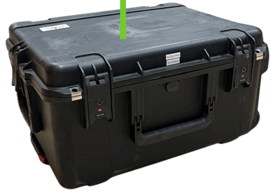
12 Port Power Block